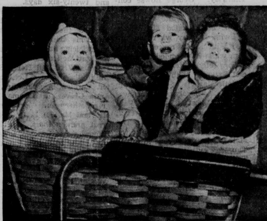
THINK WE'RE GOING TO LIKE THIS PLACE . . . Showing various emotions these three youngsters, shown shortly after their arrival from England. They will make their homes with their G.I. Dads in California.