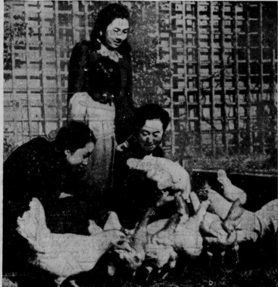
JAPANESE IMPERIAL FAMILY RAISES CHICKENS . . . This rare photo shows members of the Japanese Imperial family as they feed some of the palace chickens, maintained on the grounds during the war for family use.