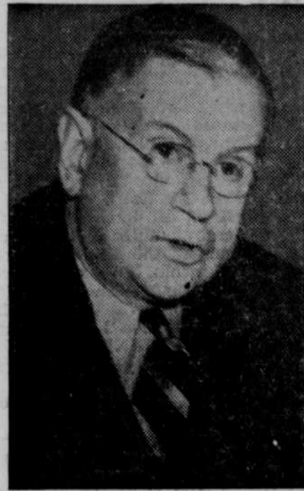
ICKES TAKES A WALK . . . Harold L. Ickes, the "Old Curmudgeon," resigned from President Truman's cabinet, with bitter attack on California oilman, Edwin W. Pauley, nominee to naval post. Ickes warned of new "Teapot Dome."