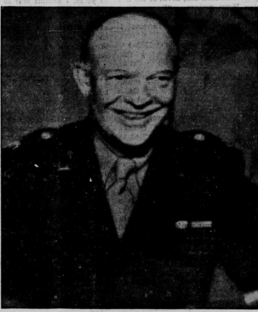
'IKE' TELEVISION STAR . . . Smiling study of General of the Army Dwight D. Eisenhower, U. S. army chief of staff, was transmitted by television from Washington to New York City during the Lincoln memorial services.