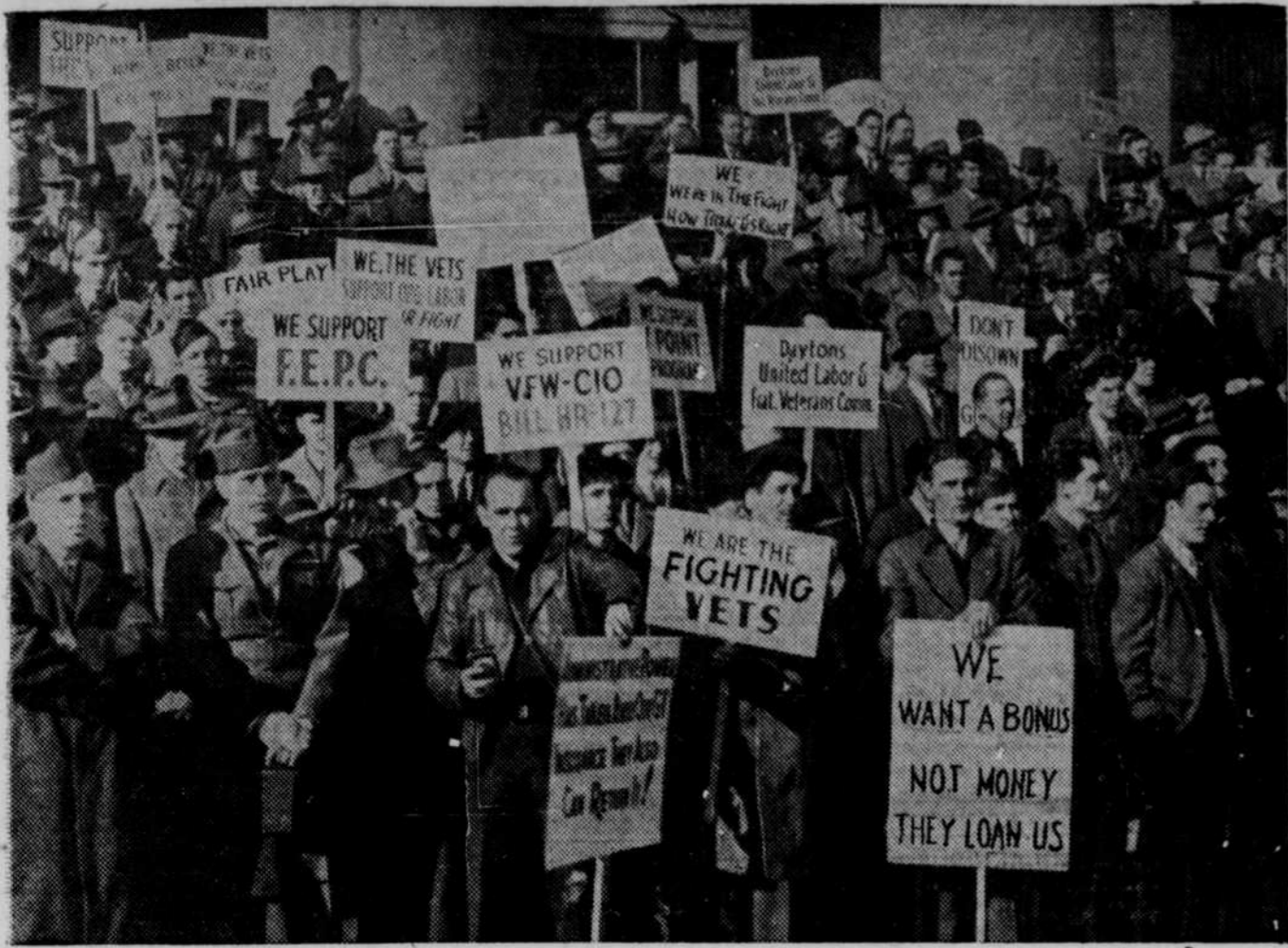
VETERANS MAKE KNOWN THEIR BONUS DEMANDS . . . A shouting but orderly crowd march upon the Ohio capital at Columbus, to demand special legislation for soldier bonus, unemployment compensation for strikers and homes for veterans.