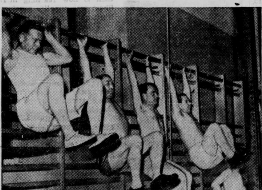
SWEDISH LAWMAKERS KEEP IN TRIM . . . By way of keeping themselves in good physical condition, members of the Swedish Riksdag (Parliament) have started their own gymnastic club.