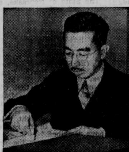
REMAIN FOREVER . . . Reports from Japan indicate that Emperor Hirohito will remain the permanent head of the Japanese government. Photo shows him in one of the few pictures in which he wore civilian attire.