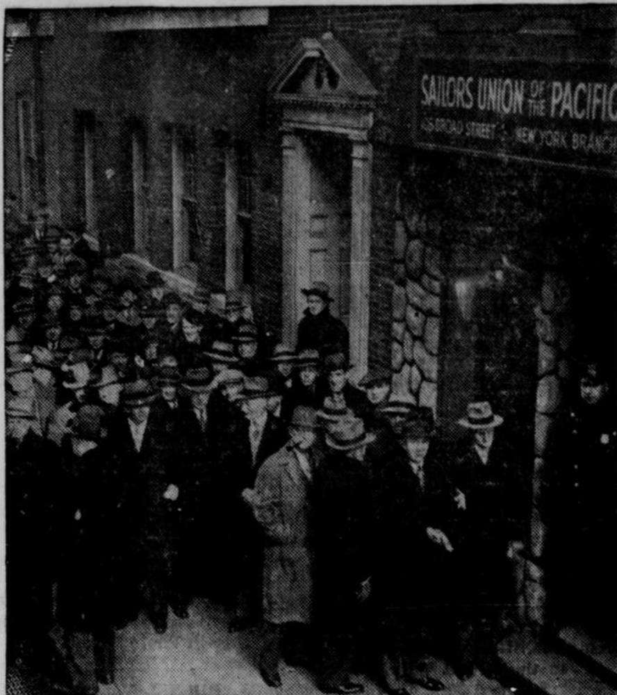
TUGMEN VOTE ON COMPROMISE . . . The 16-day tugboat tieup that shut off fuel supplies in New York City and curtailed nearly all business activity ended when the owners of the 400 tugs and the union agreed to arbitrate before a three-man board.