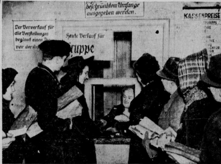
FIREWOOD FOR OPERA TICKETS . . . Before you can buy a ticket for the opera in Kiel, Germany, you have to produce a pound of firewood in addition to the price of the ducat. The wood is used to heat the building during the performance. The German sailor in uniform, at left, is working in Kiel for the British navy. Places of amusement receive no fuel rations.