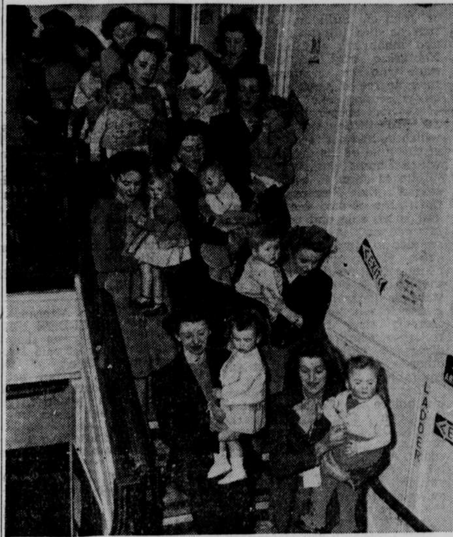
REVERSE LEND-LEASE WITH ENGLAND . . . Hundreds of British war brides and their babies are arriving in the United States to join their husbands and fathers. Immediately upon arrival of ships in New York City they are being rushed by special trains to all parts of the United States. First arrivals announced their pleasure of the clothing and food conditions in America, but refused to discuss politics.