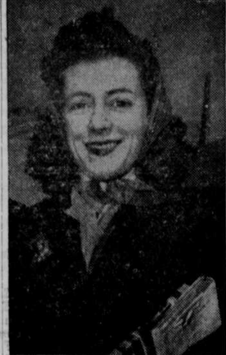
'WINNIE'S DAUGHTER' . . . Mrs. Sarah Churchill Oliver, eldest daughter of former British Prime Minister Winston Churchill, is shown as she arrived by air at New York City, en route to Miami to Cuba to join her parents.