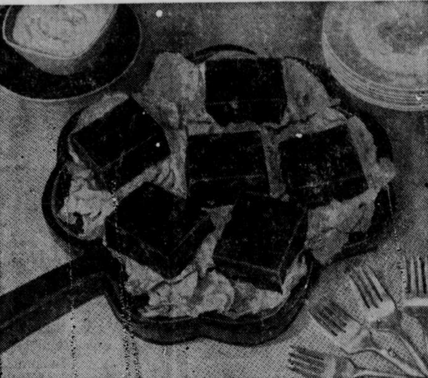
Serve Salads for Afternoon Snacks (See Recipes Below)