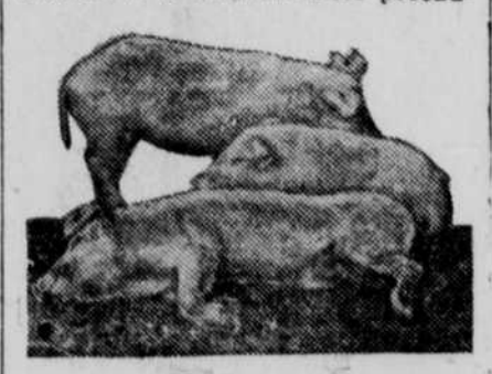
Typical cholera-sick hogs.

FOR SALE—Two Oil heaters, 75 feet steel cable, wool blankets, two kerosene Ranges.—Hank's Second Hand Store. 39-1*