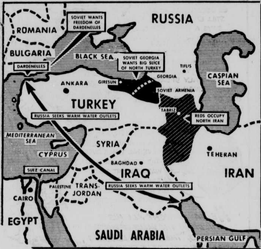
WHAT RUSSIA WANTS . . . Among the major problems that will cause headaches for the United Nations assembly is the easing of Russo-Turkish relations. The map above shows what Russia wants from Turkey. It also shows that the situation in Iran. Many observers of international chess-playing believe that Russia's biggest want at the moment is freedom of the Dardanelles and access to warm water outlets. Russia has wanted such outlets for centuries and believes that she is now, as a member of UNO, entitled to have these demands met in full.