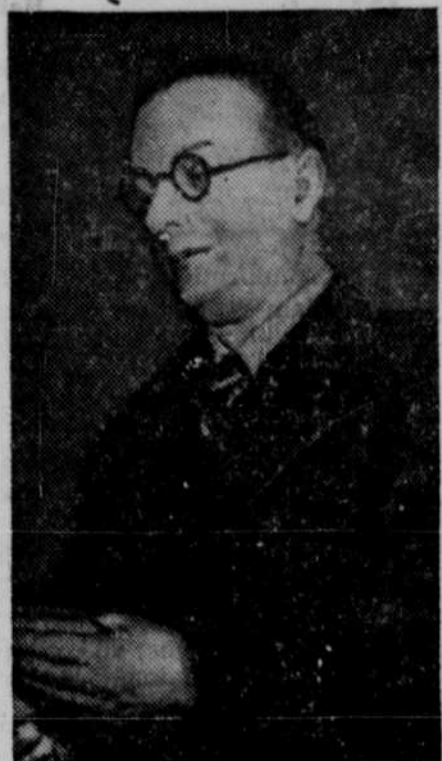
LEADS FRANCE . . . Felix Guoin, 61, Socialist leader of the constituent assembly, who has been elected as interim president of France. He replaces Gen. Charles de Gaulle, having received 497 votes out of a possible 555.