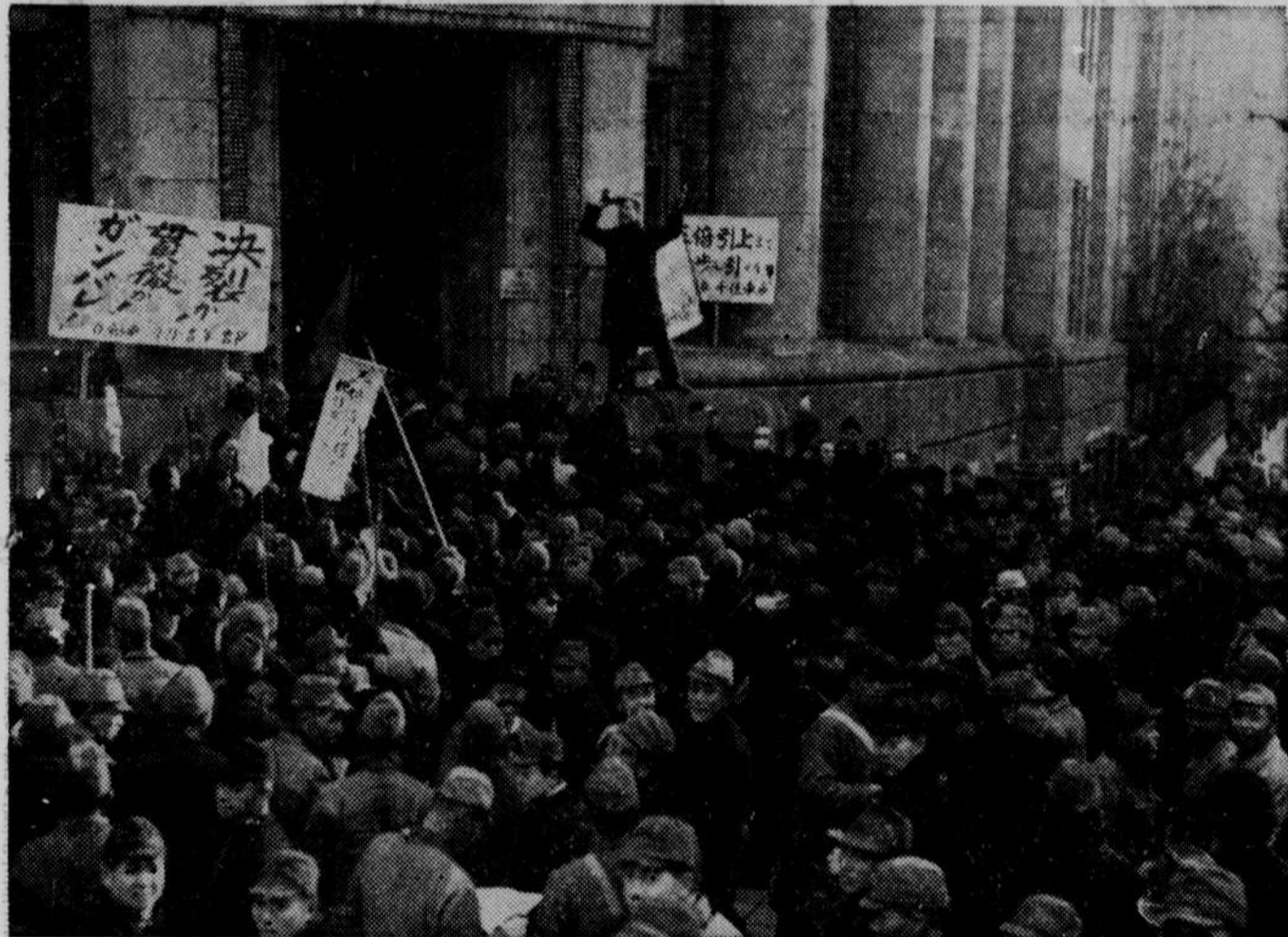
STRIKES ALSO HIT JAPAN . . . While the United States is blanketed with strikes in many industries, natives of Japan decided to follow suit. Shown above is strike held by thousands of municipal workers in which they emphasized their demands for at least three times their present wage and for better living conditions. They stormed the Tokyo city hall, where they are shown making their demands. Strikers claim that the inflation has made it impossible for them to live on present wage scales.