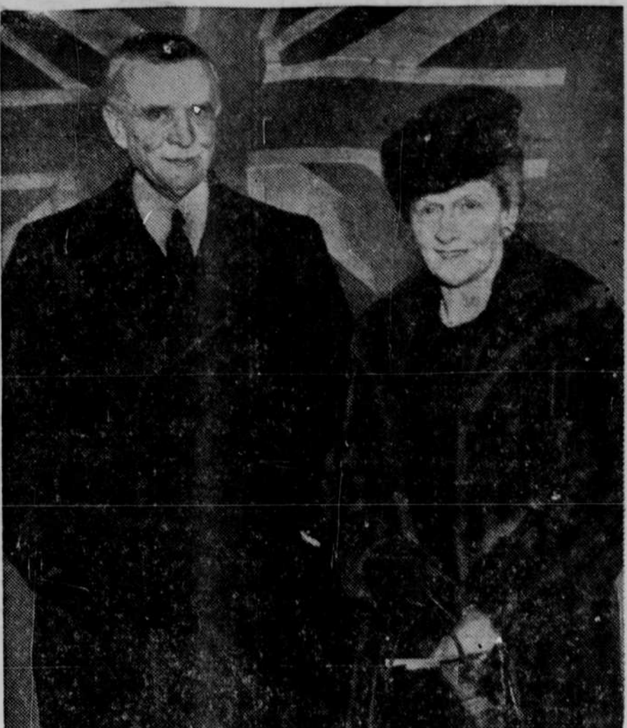
LADY ASTOR COMES HOME . . . Pictured against a backdrop of a British flag at the pier, following their arrival in New York City, are Lord and Lady Astor. The viscountess, American-born former member of parliament, is en route to Virginia to visit relatives. When asked her plans, Lady Astor stated that she "might run for congress." Matter of lack of American citizenship stands in her way at present, however.