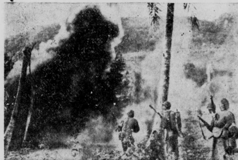
Saipan marines attacking a Jap position, flush the enemy out with demolition charges, and pick them off with rifle fire as they try to escape. The moment the photo was made marines had just killed a Jap who had tried to escape from his foxhole. Seven-eighths of the Saipan American losses were marines.