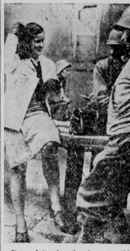
Press interview is given by this German nurse, taken during fighting around Cherbourg. With other nurses she was later transported back to her lines while hostilities ceased.