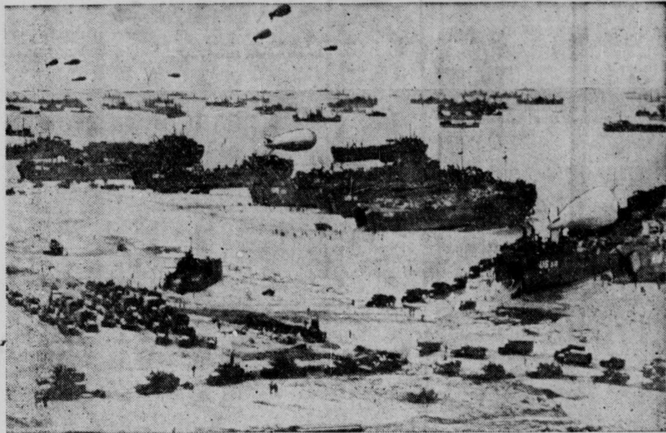
Striking panorama of the French invasion beach was made by a coast guard combat cameraman from a hillside cut with trenches, in foreground, by ousted Nazi defenders. The channel is black with ships as reinforcements and supplies pour ashore to reinforce the troops to continue their advance southward. Barrage balloons float overhead to protect the landings. Until captured harbors have been repaired, and perhaps even later, the beachheads are being utilized to land men, supplies, munitions and food as well as hospital and canteen supplies now being furnished the invaders.