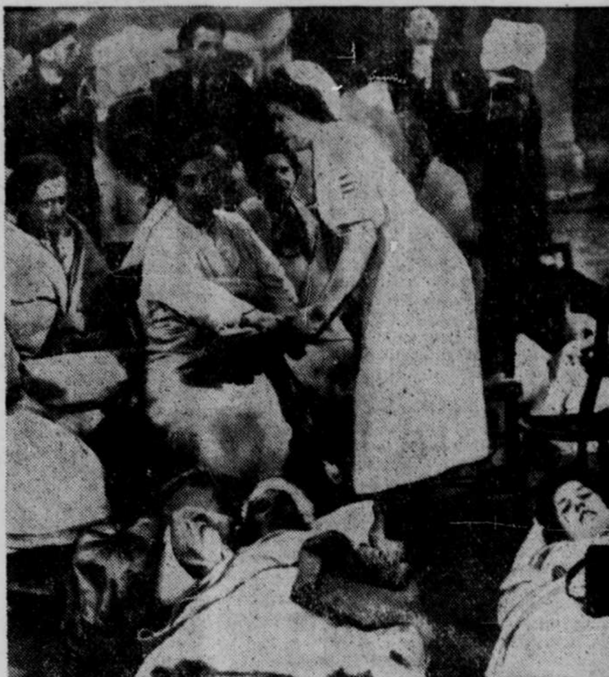
This radiophoto received from London shows patients being received at a hospital after the building in which they had been hospitalized was hit by a Nazi flying robot bomb. More than 2,752 persons were killed and 8,000 hospitalized in first report issued by Prime Minister Churchill. While effective steps have been taken to combat the effectiveness of new robot campaign, and the majority of them are destroyed, they still remain a serious threat to London.