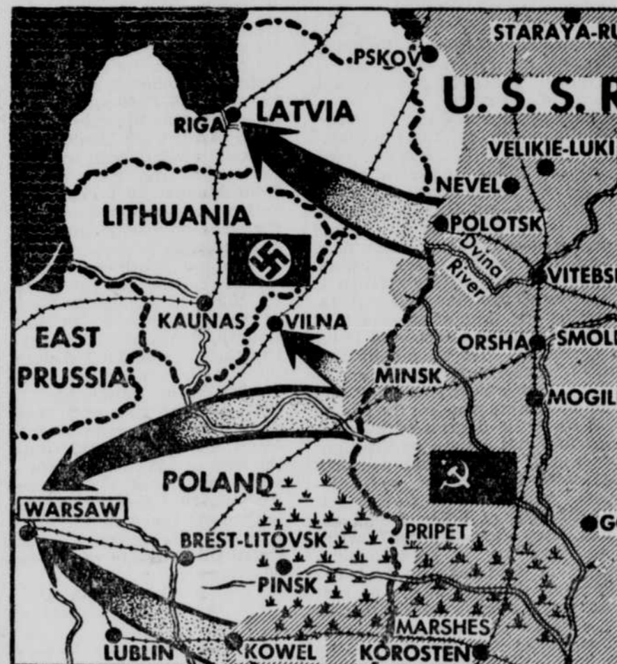
With the evacuation of Kowel by the Germans, the way was made clear for the Red army to apply the pincers to the strategic city of Warsaw. Map shows how Minsk and Kowel may be used as springboards for that drive. Vilna a prey from Minsk with Latvia's capital city, Riga, menaced by a drive from Polotsk.