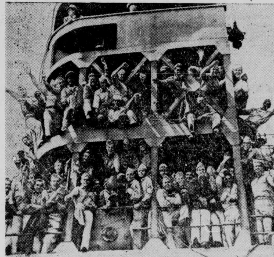
The first marine division, with 2,743 happy members, arrived in San Diego after 26 months in the South Pacific. This unit struck America's first land blow at Japan at Guadalcanal. Their most recent action was on New Britain island where they drove out the Japs.