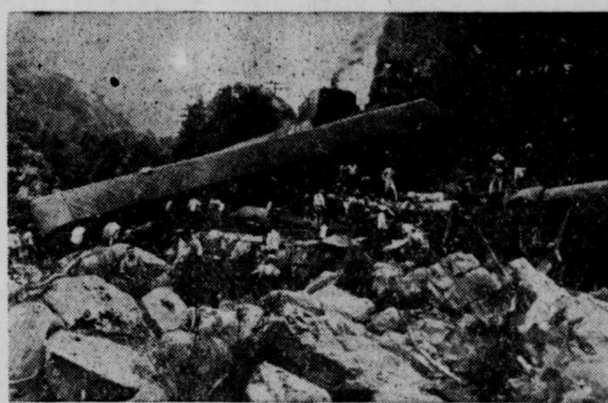
At least 17 persons, all but two of them soldiers, were killed and scores of persons injured when an L. and N. troop train plunged into a 50-foot gorge of the Clear river 11 miles south of Jellico, Tenn. The train was carrying more than 1,000 GIs just out of training. The baggage cars and kitchen burned.