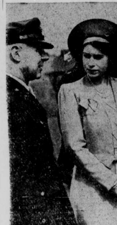
Princess Elizabeth is shown here in conversation with Lieut. Gen. James Doolittle, commander general of the U. S. Eighth air force after the princess christened a flying fortress "Rose of York," at an American bomber station in England.