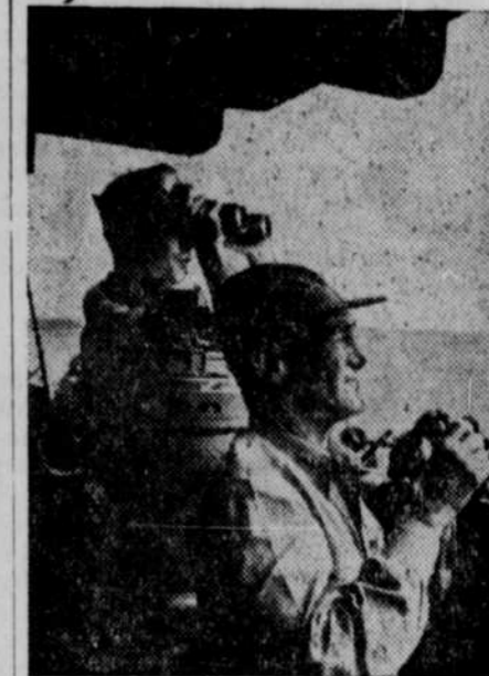
Vice Adm. M. A. Mitscher, commander of Task Force 58, aboard his carrier off Saipan during encounter with Jap fleet in the Marianas. He is watching the launching of planes.