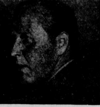
WILLIAM S. KEIGHLEY pictures—"George Washington Slept Here," "The Man Who Came to Dinner," etc.—before he went into the army. He's working now on "I Love You Truly," based on the life of Carrie Jacobs Bond .

It was only after a long, long search that William S. Keighley was chosen to succeed Cecil B. DeMille as producer of that radio theater program. Keighley did some fine