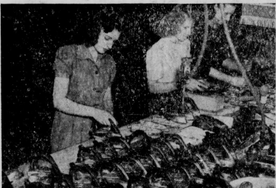
Newest kind of iron, a Eureka company cordless electric, which operates from safety base to which cord is attached, is shown coming off the assembly line. The iron operates from a thermostat-controlled electric safety base from which instant heat is drawn by brief electric contact. A micro-heat regulator in base governs temperature.