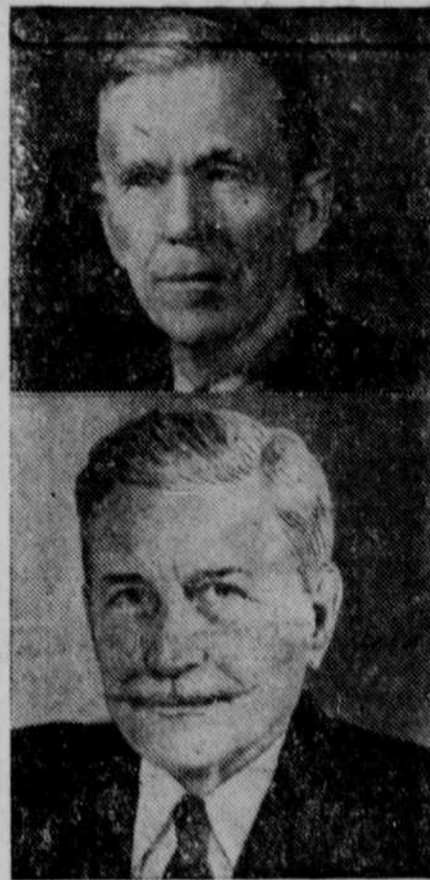
General of the Army George C. Marshall, upper, who steps into the world's No. 1 postwar trouble spot, China, due to his recent appointment as ambassador, succeeding Maj. Gen. P. J. Hurley, lower, who resigned to protest against policies in China.