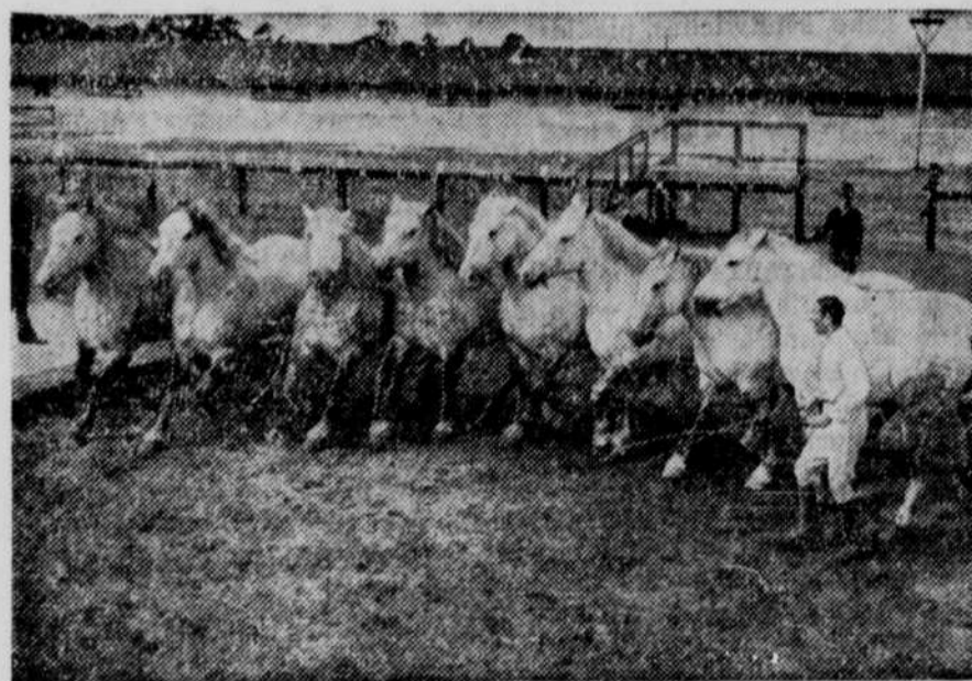
For the first time in the history of the circus, Percherons are being trained to become sawdust ring stars. Sometimes known as the Percheron Norman, named from La Perche, a French district, this type of horse is ordinarily a work horse. These magnificent specimens are being trained at the Sarasota, Fla., circus winter training headquarters.