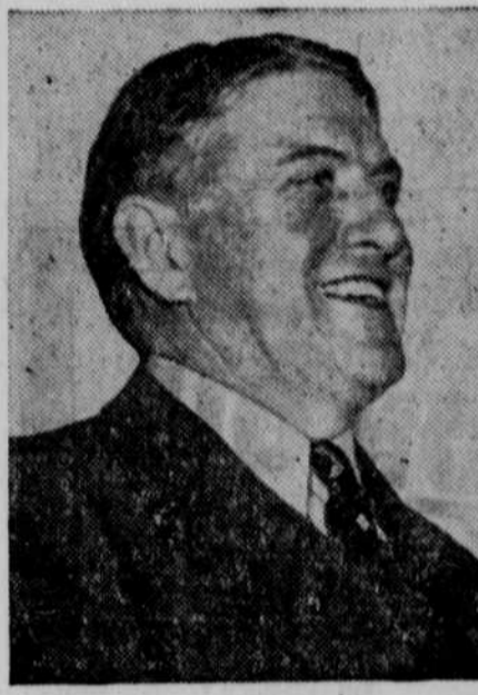
John Stelle, ex-governor of Illinois, who will serve as commander of the American Legion during 1946. With hundreds of thousands of veterans of World War II joining with veterans of World War I in the Legion, it becomes the largest organization in U. S.