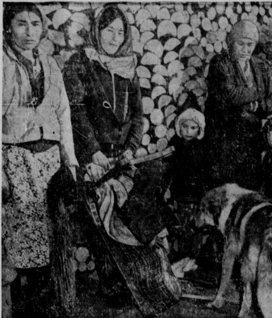
As is the habit of women the world over, these Indian women, whose husbands are employed at the Pickle Crow gold mine in Canada, await their husbands with their pay checks. Indian workers are paid at the same rate as white men, average base pay of $47 per week, but it is said many prefer credits at local stores to actual cash.