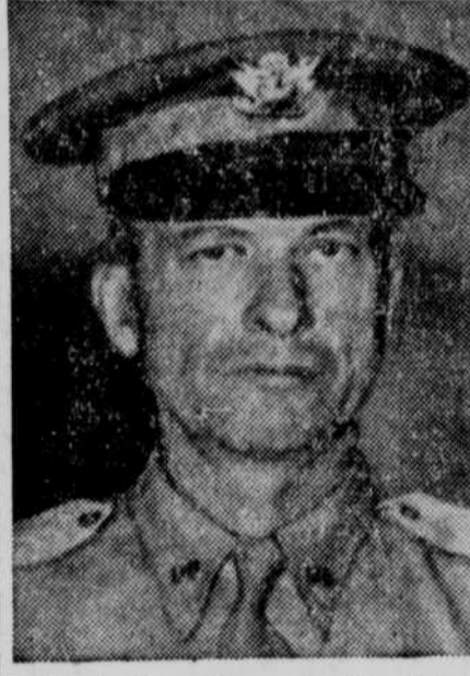
Lieut. Gen. Alexander M. Patch, veteran of World War I, who also fought against both the Germans and Japs in World War II, recently died at San Antonio. He lost his son in this war.