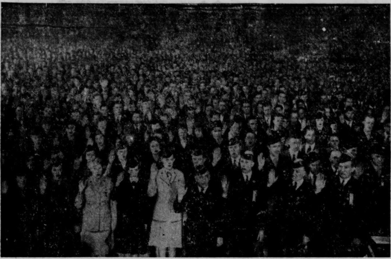
The American Legion has seen many thrilling things at its 27 conventions, but never a more stirring sight than was presented in the Coliseum in Chicago, as pictured above. Some 6,000 men and women veterans of World War II were sworn into the Legion while spectators held their breath as the candidates repeated the pledge. The Legion plans to recruit five to six million veterans of the last war to add to their ranks.