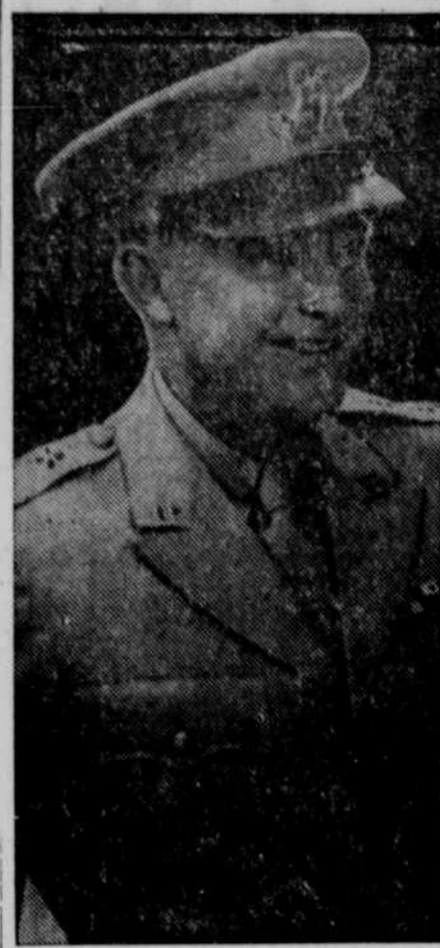
General of the Army Dwight D. Eisenhower, while attending the American Legion convention in Chicago, was nominated by President Truman to succeed General Marshall as chief of staff of the army. He started on his duties immediately.