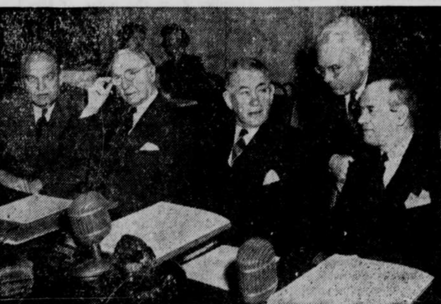
Hearings were started on the Pearl Harbor disaster before a joint congressional committee. Left to right: Sen. Scott W. Lucas, Illinois; Sen. W. F. George, Georgia; Sen. Alben Barkley, Kentucky, chairman; Sen. Homer Ferguson, Michigan; and Rep. Jere Cooper, Tennessee (standing, who is chairman of the house group of the committee.