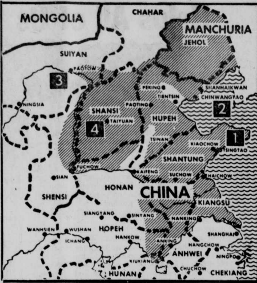
Shantung province seaport of Tsingtao took a place in the forefront of undeclared civil war in China when Chiang's troops were landed from American transports. Occupied since October 11 by U. S. marines, the possibility of involvement in clashes has been heightened by fact that Chinese Communist forces ring the port by land.