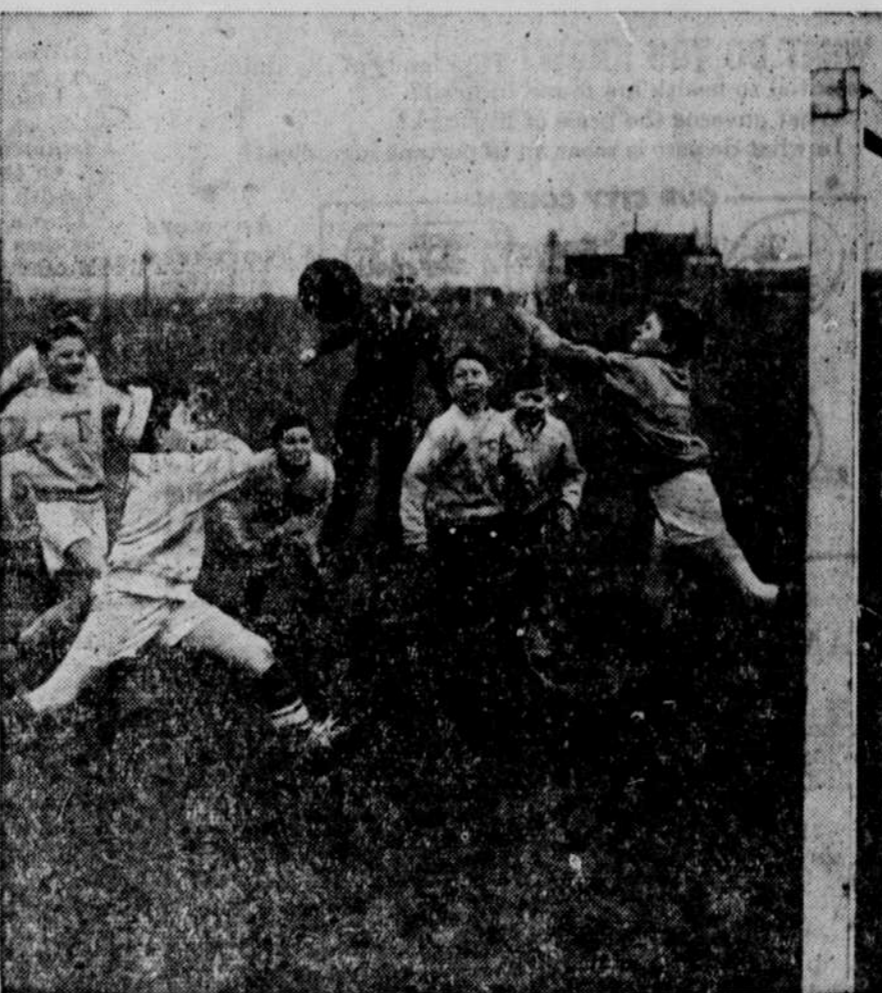
Soccer was the first kind of foriball played in the United States. It is the only game of football played in most of the world. The greatest single soccer organization in the world is the Lighthouse Boys' club in Philadelphia, consisting of some 500 players. Photograph shows how the club is developing new champions from among the youngsters.