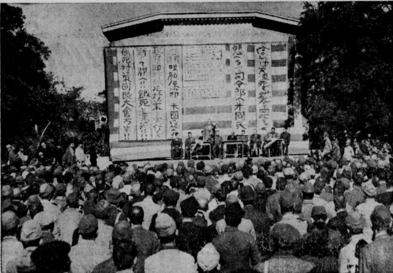
A huge throng of Japanese face a bannered platform in Hibiya park, Tokyo, during a demonstration against the current food shortage. The park is in downtown Tokyo, adjacent to the palace grounds. The Japanese objected not only to lack of food, but to any control over their food supplies.