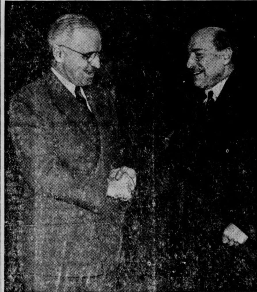
Prime Minister Clement Attlee of Great Britain was greeted by the nation and congress when he arrived to meet with President Harry S. Truman to work out plans for the control of the atomic bomb. While in Washington he met with officials from Canada as well as members of congress and the U. S. state and war departments.