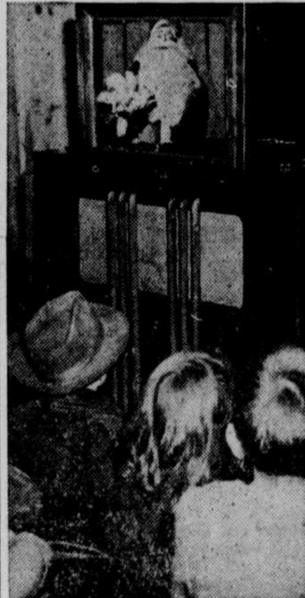
Early visits are being made into American homes by Santa Claus by way of television. When he visited large department store in Philadelphia, he was seen throughout the building by television. Next year he may visit many homes this way.