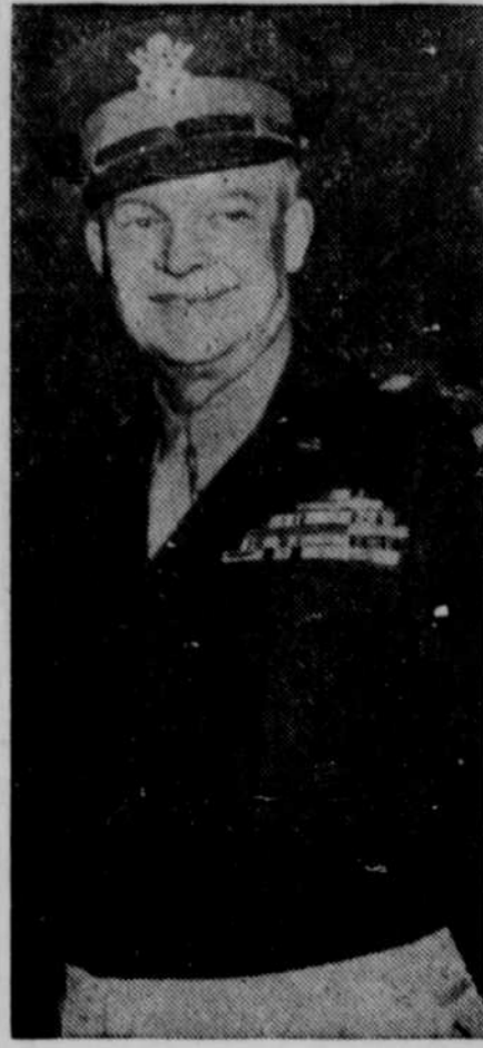
Latest photograph of Gen. Dwight D. Eisenhower, taken while on recent trip to Washington. Washington reports indicate that he will soon relieve General Marshall as chief of staff. He has gone on record as favoring a single unit of national defense.