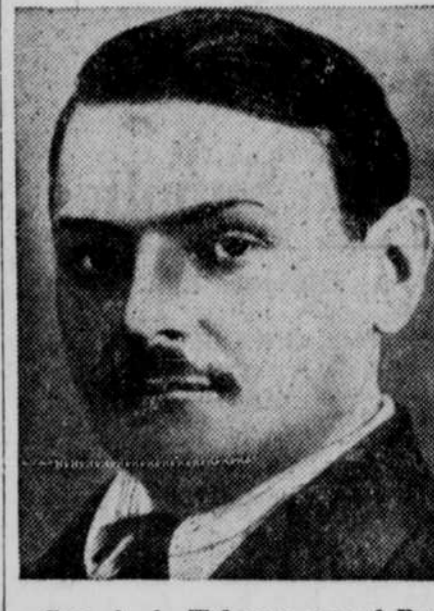
Gen. A. A. Zhdanov, one of Russia's most powerful behind-the-scenes political figures, who, Stockholm reports, has been named by Premier Stalin as his successor in case Stalin's illness continues.