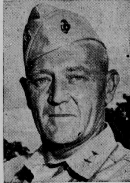
Maj. Gen. Graves B. Erskine of the U. S. marine corps, who has been appointed director of retraining and re-employment administration of the U. S. labor department, which will handle the vocational rehabilitation and education of discharged veterans.