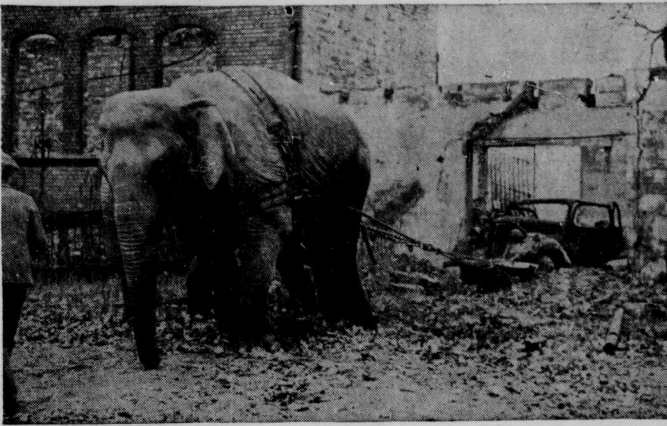
Kieri, 35 years old, is one of the elephants placed into service to aid in the cleaning up of much-bombed Hamburg, Germany. Kieri is being assisted in the job by Many, a 25-year-old mate, barely visible on offside. They are pulling the remains of an automobile from a blitzed building. An elephant can haul 3,000 pounds without much effort, and never seems to tire, even after long hours of work.