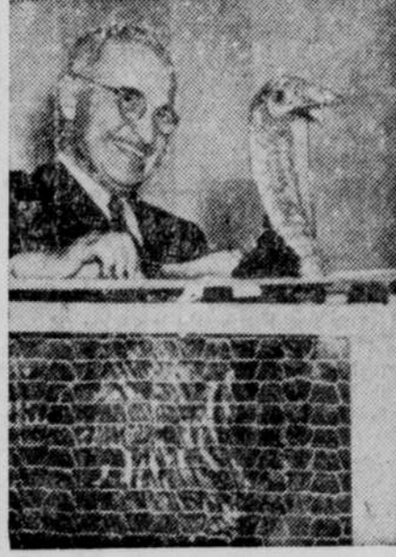
President Harry S. Truman is shown with a 48-pound turkey presented to him on behalf of the turkey growers of Minnesota. It won first prize in Minnesota turkey show.