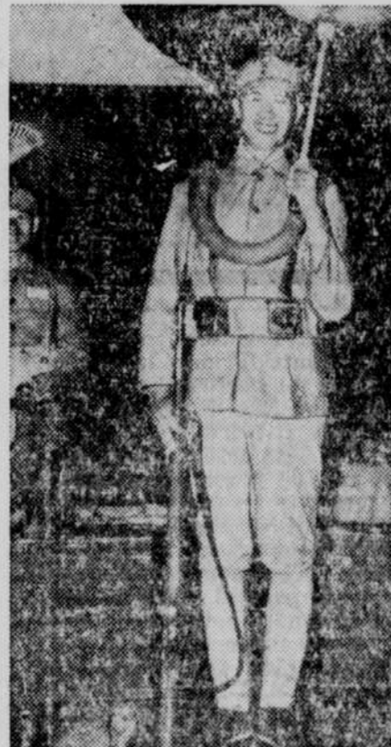
With his "G.I." umbrella protecting him from the rain, this grinning Chinese sentry of the 70th national army stands guard at one of the docks at Kiiurum, where the Chinese troops were landed by units of the U. S. 7th fleet.