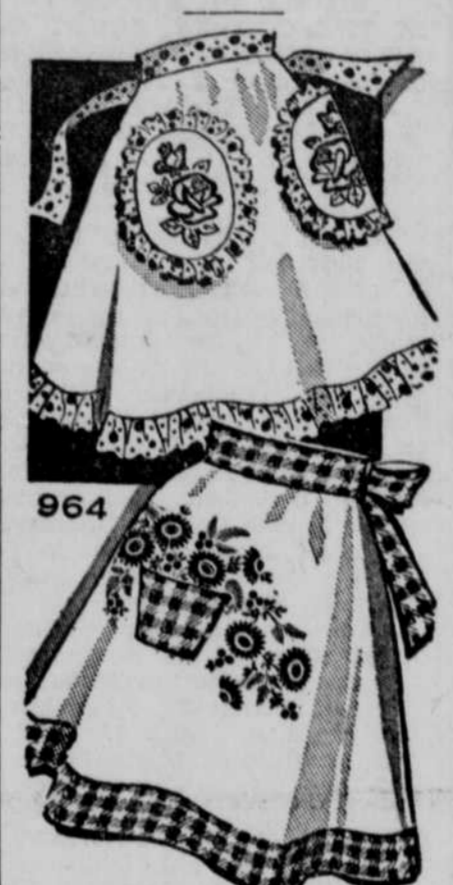
A GAY apron adds glamour to your role as hostess. These aprons take little material. Colorful embroidery that a youngster would love to do.

You can make these aprons from one pattern. Pattern 964 has transfer pattern of an 8 1/4 by 11 1/2 and two 3 1/2 by 5-inch motifs; directions.