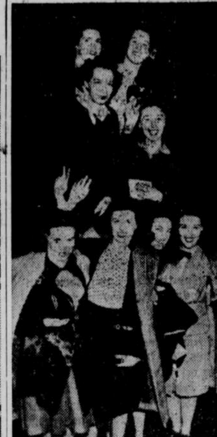
Some of the hundred and twenty brides and twenty brides-to-be of members of Royal Australian Air Forces are shown as they arrived in Seattle enroute to San Francisco. The delegation will embark for Australia to join their husbands and fiancés whom they met in Canada.