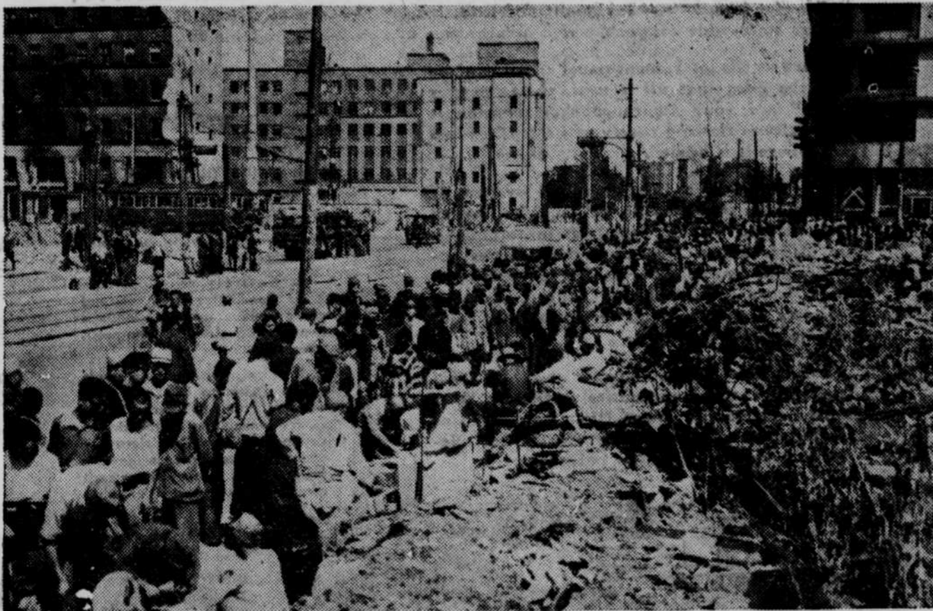
Customers crowd around the sidewalk stands in the Ginza District in Tokyo, which is similar to New York's Fifth Avenue. Shopkeepers, their stores destroyed by bombs, set up their wares in the street, and carry on their business outside the wrecked buildings. In the background is the famous Jap Department Store, Takashimaya, where only two floors are now in use.