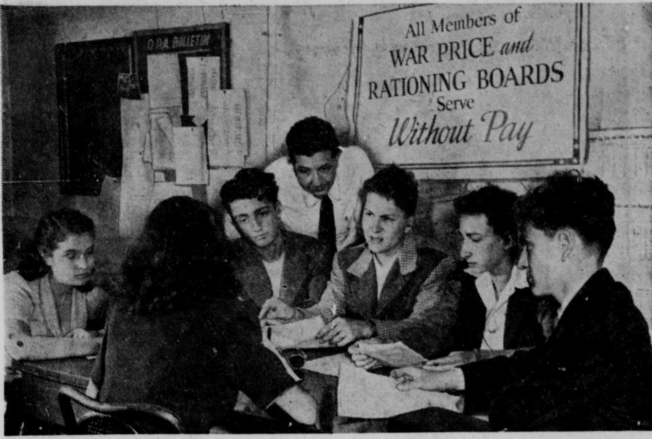
Photo shows the price panel in session, when the students of Midwood High school took over the operation of the Office of Price Administration's local rationing board in Brooklyn's Flatbush section for a day. For twelve hours the enterprising youngsters ran the rationing and price control machinery, with, of course a little expert supervision by a regular aide in interpreting some of the knottier problems.