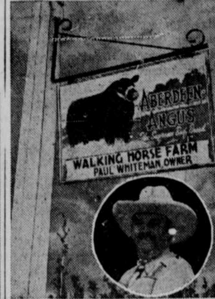
Paul Whiteman, insert, and entrance to the farm of the erstwhile "King of Jazz." Whiteman has made a paying proposition out of his farm, which he has stocked with purebred cattle, horses and poultry. He does much of his own work.