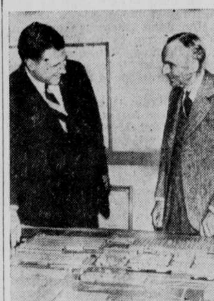
Henry Ford II, who was recently named president of the Ford Motor company, is pictured talking to his grandfather, who resigned from the office.