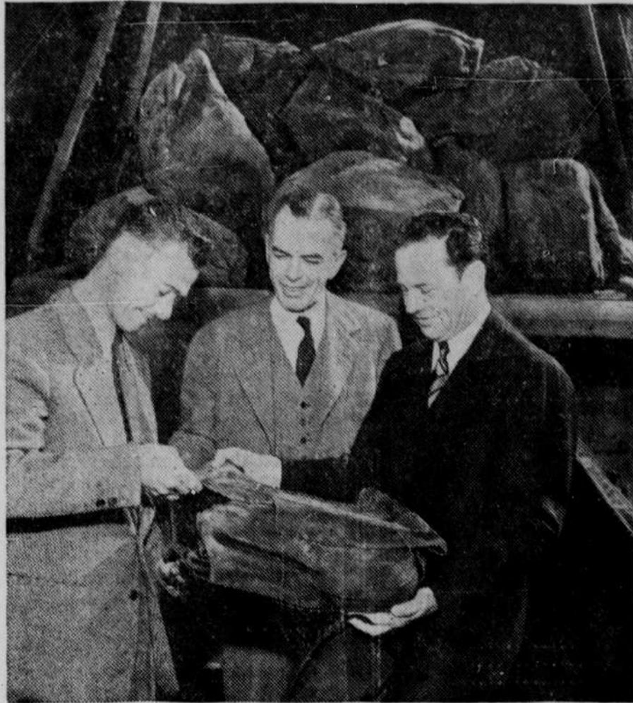
The nation's first shipment of rubber from the Pacific since Pearl Harbor, produced under the very noses of the Japanese in the Philippines, recently arrived at San Francisco. Forty-two tons of the precious crude stock was shipped from the Pathfinder plantation of the Goodyear Tire and Rubber company in Mindanao.