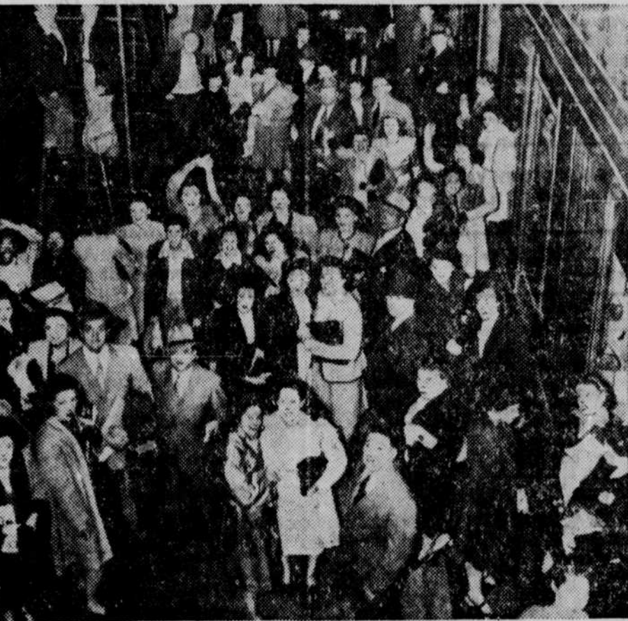
View of crowded Empire State building lobby after elevator strike went into effect. Workers seem hesitant about climbing stairs to their offices, and have backing of health authorities who put limit at eight flights for workers under 30 years old.