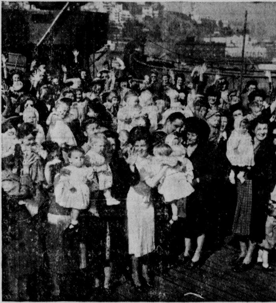
When the former luxury liner Lurline docked at San Francisco recently, the cargo included 555 Australian war brides of American servicemen and some 200 of their children. Hundreds of other war brides are awaiting transportation from Australia as well as from England, France, and other European countries. They will all be brought here soon.