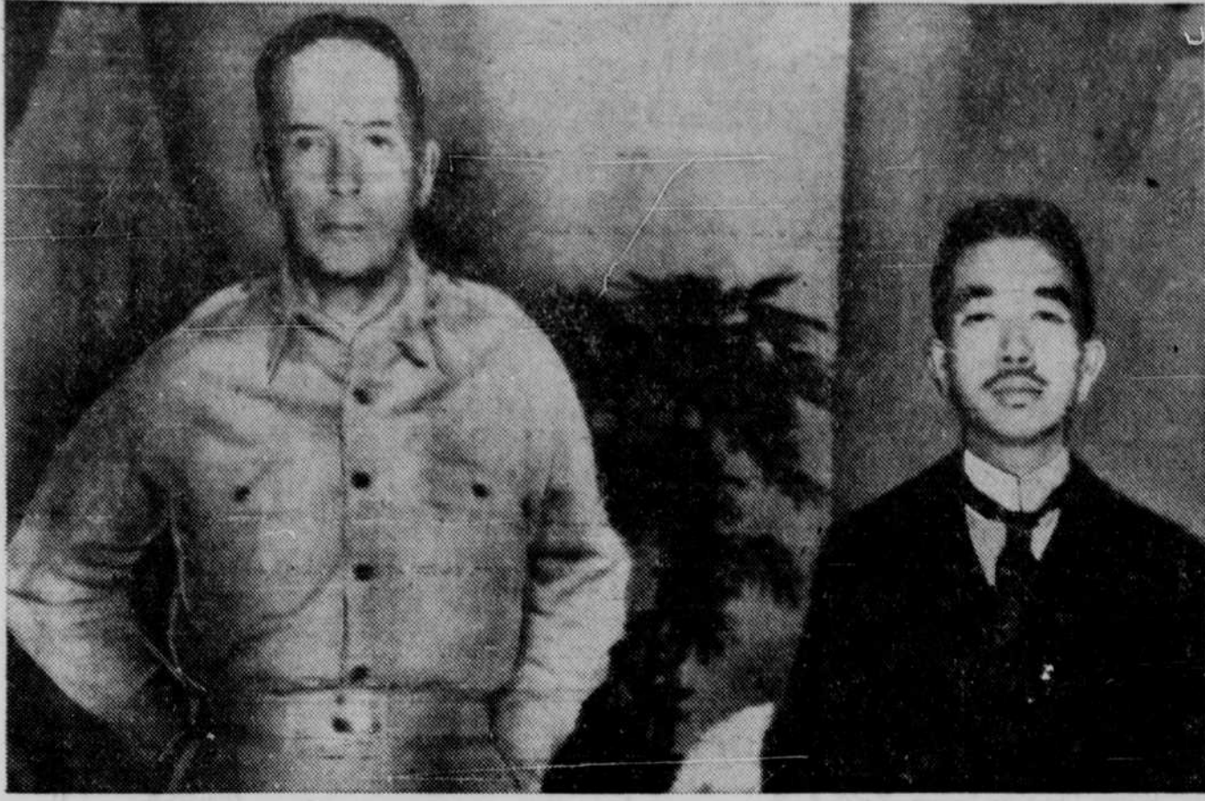
Japan's emperor went to meet Japan's conqueror, General of the Army Douglas MacArthur. It was the first time in 2,000 years of Japanese history that a mikado had left the royal palace to be received by a foreigner. Emperor Hirohito, "The Son of Heaven," was dressed in formal morning attire, not in his flamboyant dress of admiral or marshal. The conquered ruler bowed to American correspondents.