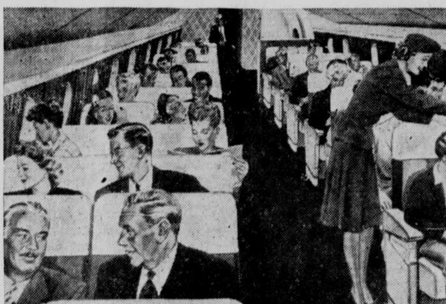
Above is an artist's drawing of the Constellation's interior, showing the seating accommodations for the passengers. This will be typical of the accommodations that will be found on most airliners in this country, as well as those covering around-the-world routes. They will also be provided with kitchens and service rooms for comfort of travelers.