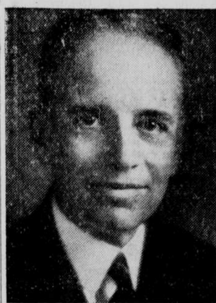
William Dewitt Mitchell of New York, a lifelong Democrat who served as attorney general under President Hoover, has been appointed counsel for Pearl Harbor quiz.