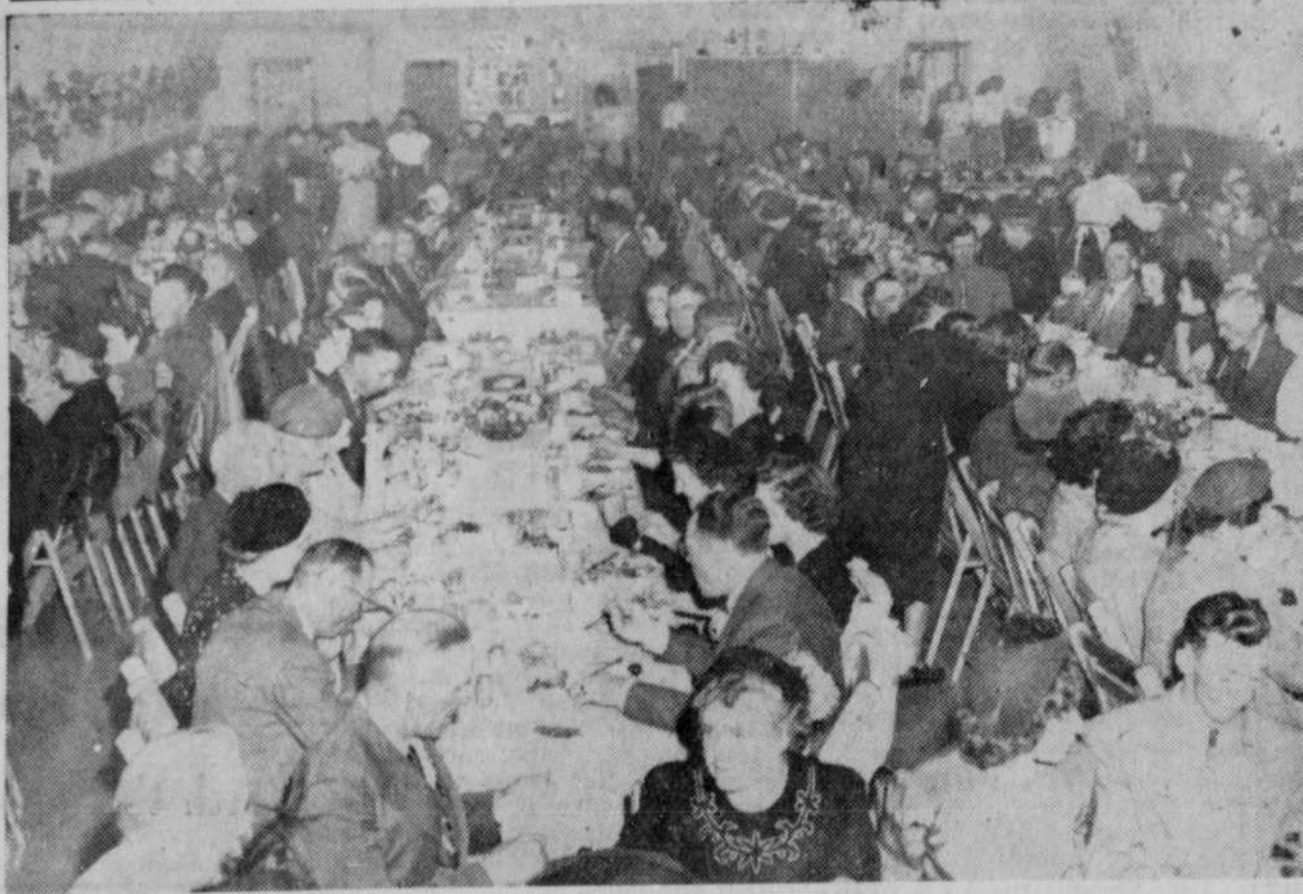
$5-PER-PLATE CHICKEN . . . Over 370 friends of St Anthony's hospital turned out Monday for a banquet which formally marked the drive's going over the 100-thousand-dollar mark. (See story on page 1.)