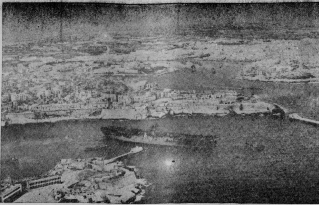
bor, Malta, during a recent goodwill tour of the European ports along the Mediterranean.

Uncle Sam's aircraft carrier USS Philippine Sea gracefully slips out of Grand Har-