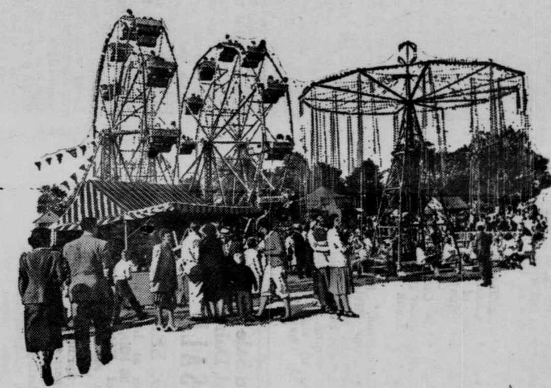
NEAR LEGION CLUB