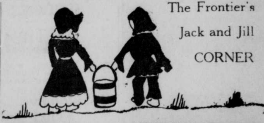
The Frontier's Jack and Jill CORNER

"Voice of The Frontier" . . . thrice weekly.