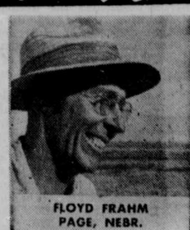
FOR STEADY PROFITS

It's my job to see that you get the latest information on modern hybrid corn. The Steckley Hybrid Corn Company of Lincoln, Nebraska, in my opinion has the corn we need for planting in this Start with area. If I don't get around fast enough, just give me a call and I'll make a special trip. I'll be glad to visit Stay with with you soon.