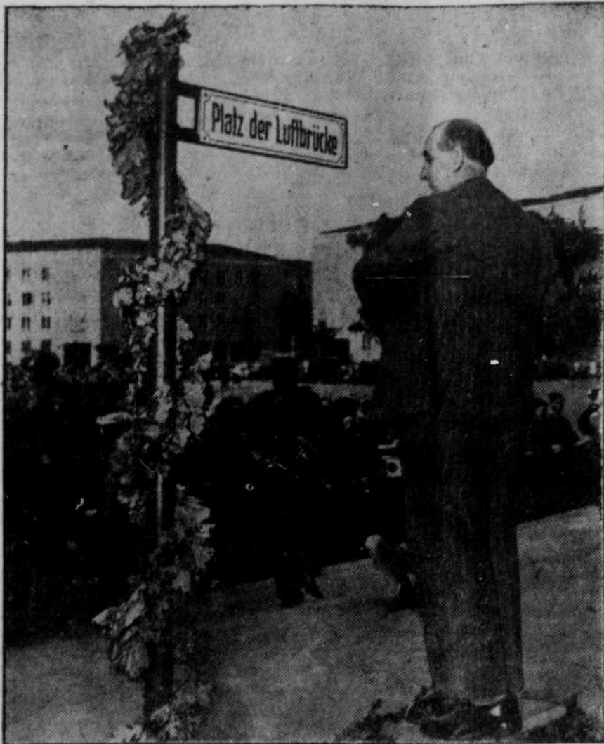
"THANKS FOR THE AIRLIFT" . . . Berlin's Lord Mayor Ernst Reuter says it by dedicating the "Platz der Luftbrücke" ("Square of the Airlift") in the German city. It was by way of commemoration of the Allied air operations which pulled Berliners through the long siege of the Russian blockade.