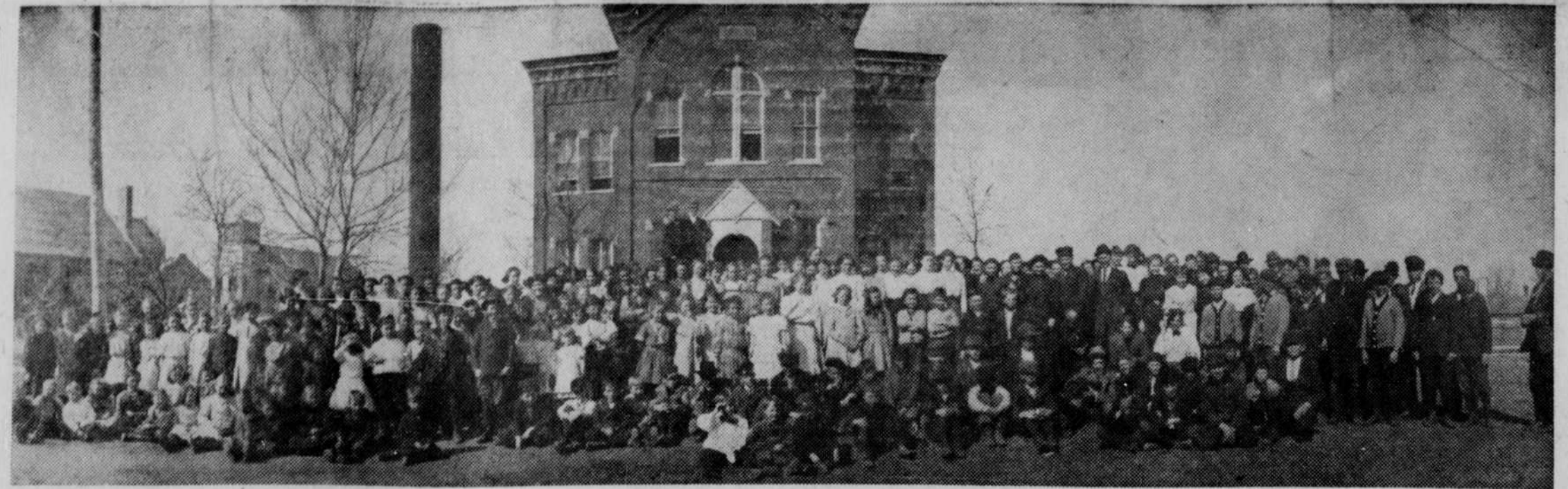
In 1908 the pupils at the O'Neill public school will enjoy picking themselves out in this photograph. Building later gave way for a new building (pictured on page 4, section G.)