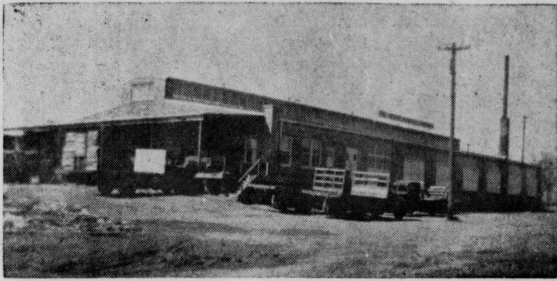
View of Our Produce Plant