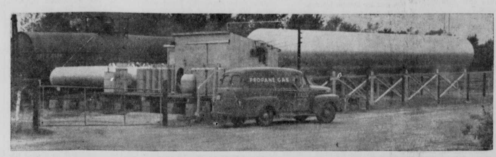
VIEW OF OUR BULK TANK AND EQUIPMENT NEAR C. & N. W. TRACKS