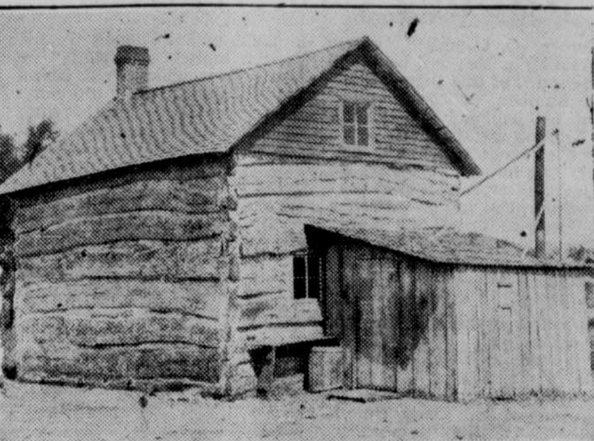
FIRST IOFF HALL . . . Independent Order of Odd Fellows, established in 1873, was among the first fraternal groups in the county. Above photo shows first lodge hall