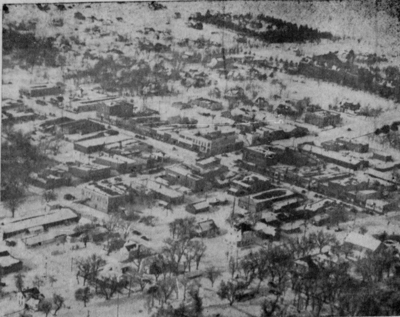
When asked to submit an aerial view of O'Neill for the Diamond Jubilee Edition, The Frontier's Staff Photographer chose this bird's eye view of the downtown section in winter.