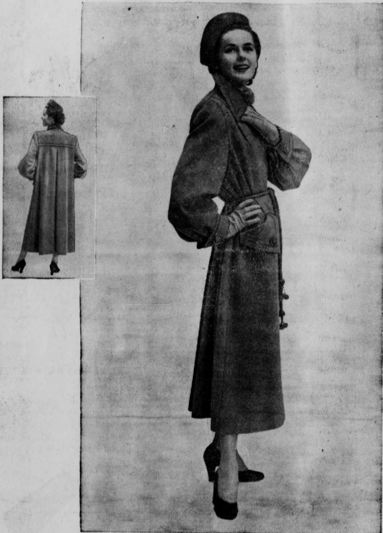
As Seen in GLAMOUR . . . 64.95