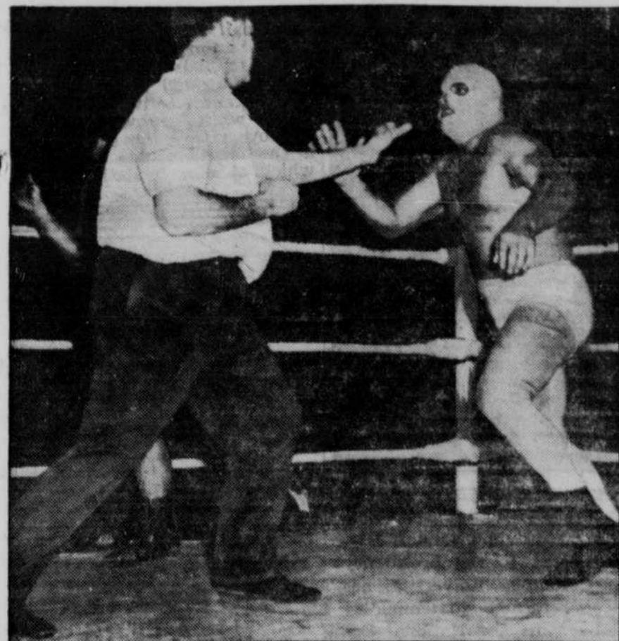
THE REF PACKS A PUNCH . . . Jack Dempsey, former world's heavyweight boxing champ, cocks a mean-looking right as the Golden Terror makes menacing advances during a dispute over a ruling in wrestling matches at Atlanta, Ga. Referee Dempsey, who used to put able-bodied men away with the gloves, knows how to take care of himself among the groaners.