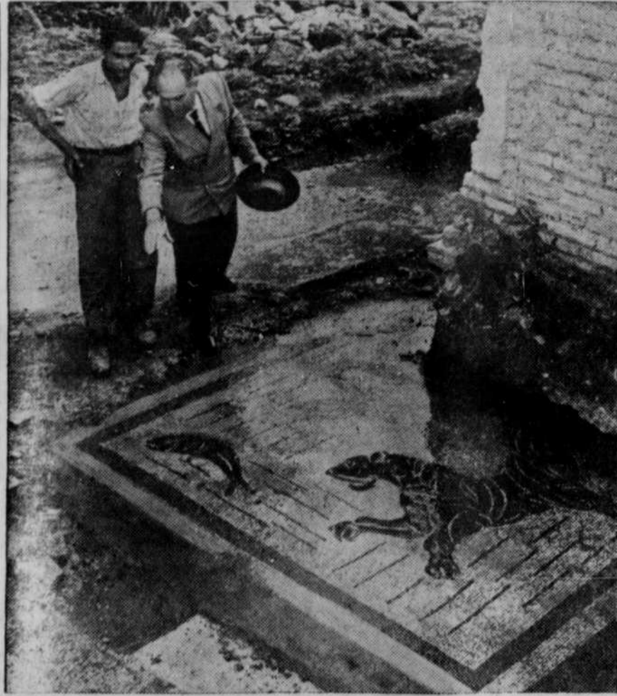
PROFITABLE DITCH-DIGGING . . . This Italian peasant (left) swears he didn't know what he was doing but an inspector of the Ministry of Culture points out that his ditch-digging in Rome was most valuable. This mosaic that the worker uncovered dates back to the Second Century, A. D., and is believed to be the floor of a Roman villa.