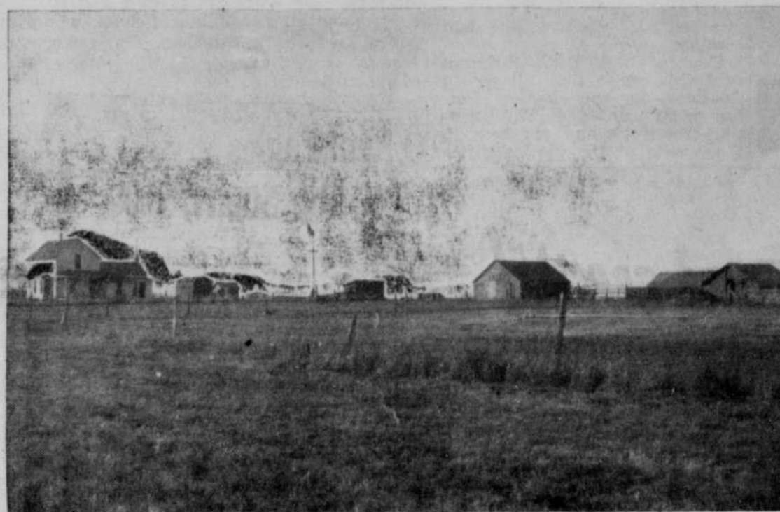
IMPROVEMENTS ON UNIT NO. 2

SELLING FRIDAY AFTERNOON, NOV. 5th — Units No. 1-2-3 at 1:30 P. M. on the Premises of Unit No. 1.