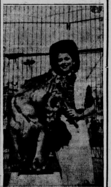
Miss ROSEMARY LOOMIS WESTERN MOVIE STAR AND WILD ANIMAL TRAINER

ADDED ATTRACTIONS The 4 Australian Queens of the Air. Direct from Europe. 124 feet high on lofty trapeze without safety nets.