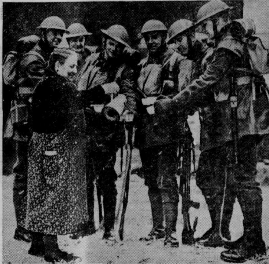
Men of the Welsh guards, British forces in France, are treated to a cup of tea by a French woman. The soldiers stand amid the ruins of a building partially destroyed during the World war. Many of the men are sons of those who fought and died in this spot during the last world conflict.