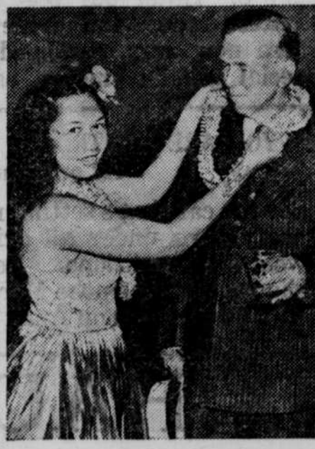
Gen. George C. Marshall, United States army chief of staff, receives a flower lei and a glass of pineapple juice from a hula girl as he steps off a plane at Hawaii, Honolulu, to inspect the territory's defense.