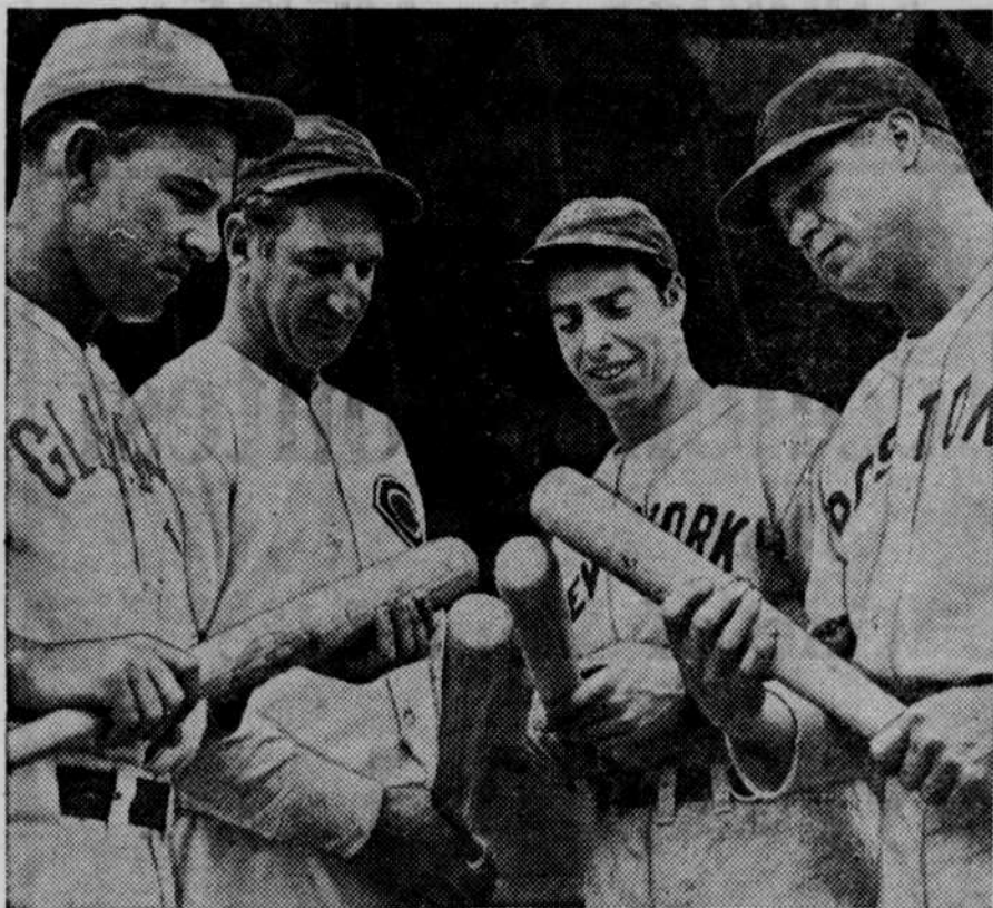
A quartet of baseball's greatest sluggers compare bats (and batting averages) at Tampa, Fla., where stars of the National league beat American league topnotchers 2 to 1 in the all-star game. Left to right: Mel Ott of the New York Giants, Ernie Lombardi of the Cincinnati Reds, Joe DiMaggio of the New York Yankees and Jimmy Foxx of the Boston Red Sox.