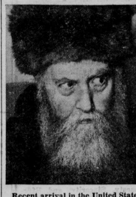
Recent arrival in the United States is Rabbi Joseph Isaac Schneersohn, leader of the movement for the preservation of orthodoxy of the Jewish faith. He was forced to spend six weeks in a cellar in Warsaw during the German invasion of Poland.