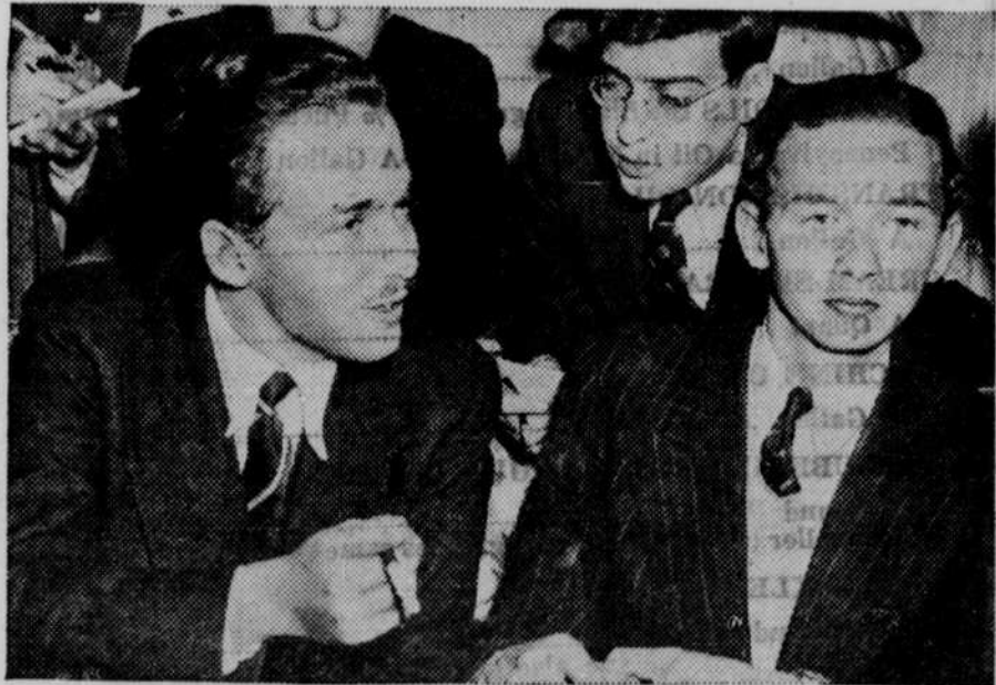
Archduke Otto of Hapsburg, seated left, pretender to the non-existent throne of Austria, and his younger brother, Archduke Felix, as they start on a three-week tour of America to "see how democracy works." Archduke Otto's study of American democracy is to be used as a model for a post-war central European federation of states.