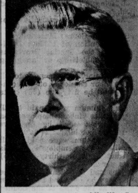
After 35 years of public life, Sen. Vic Donahey of Ohio has announced his decision to retire at the end of his present term. In Washington the senator stated that he is retiring to secure a much-needed rest.