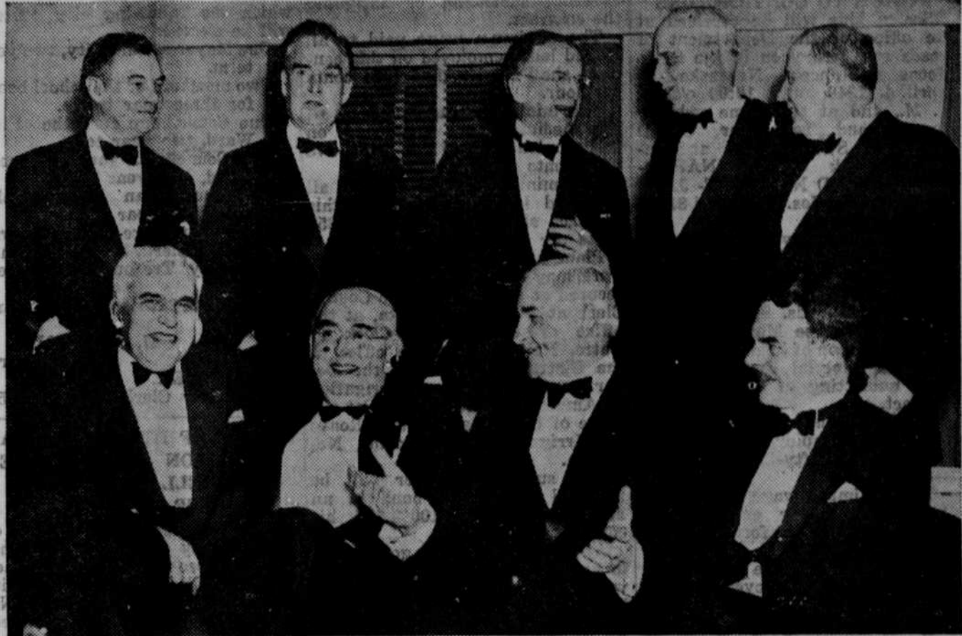
Possibilities, near possibilities, vague possibilities and one perennial candidate for the presidency are pictured at the National Press club's first political rally in Washington, D. C. Seated, left to right: Paul McNutt, federal security administrator; Sen. Arthur Vandenberg, Michigan; Jesse Jones, federal loan administrator, and District Attorney Thomas E. Dewey, New York. Standing, left to right: Robert Jackson, attorney general; Rep. Bruce Barton, New York; Sen. Burton K. Wheeler, Montana; Norman Thomas, perennial candidate of the Socialist party, and Sen. Bennett Champ Clark, Missouri.