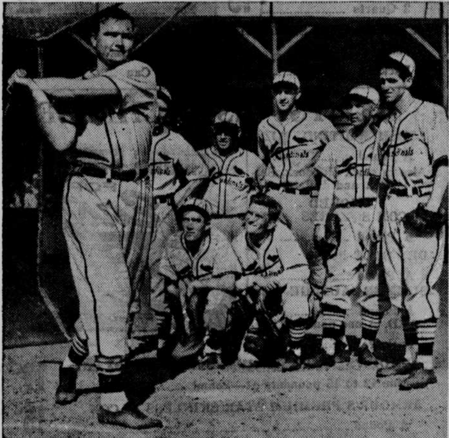
Johnny Mize, first baseman for the St. Louis Cardinals and batting champion of the National League last season, takes his turn at bat during spring practice in the Cardinals' training camp at St. Petersburg, Fla. Rookies gather around to get an idea of how the champ got that way.