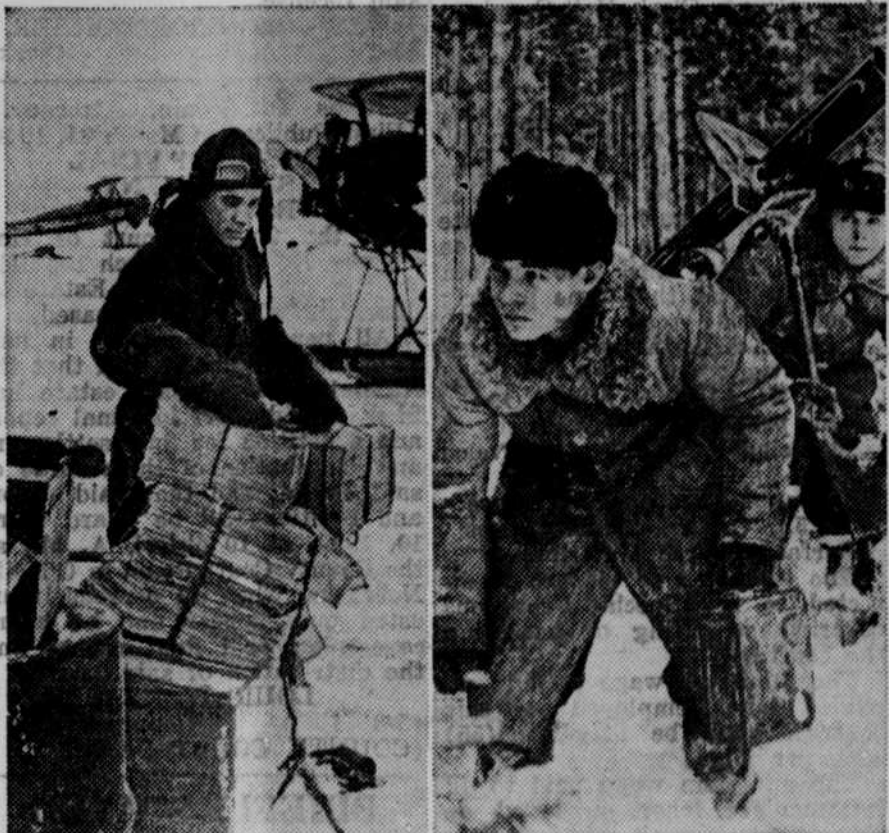
Two of the first pictures released by the Soviet censorship bureau of the Red army in Finland. Left: The Russian caption states "all units of the communications service of the Red army bring mail to the front every day. An airplane is being loaded." Right: A machine-gun team moves its weapon in search of a new position.