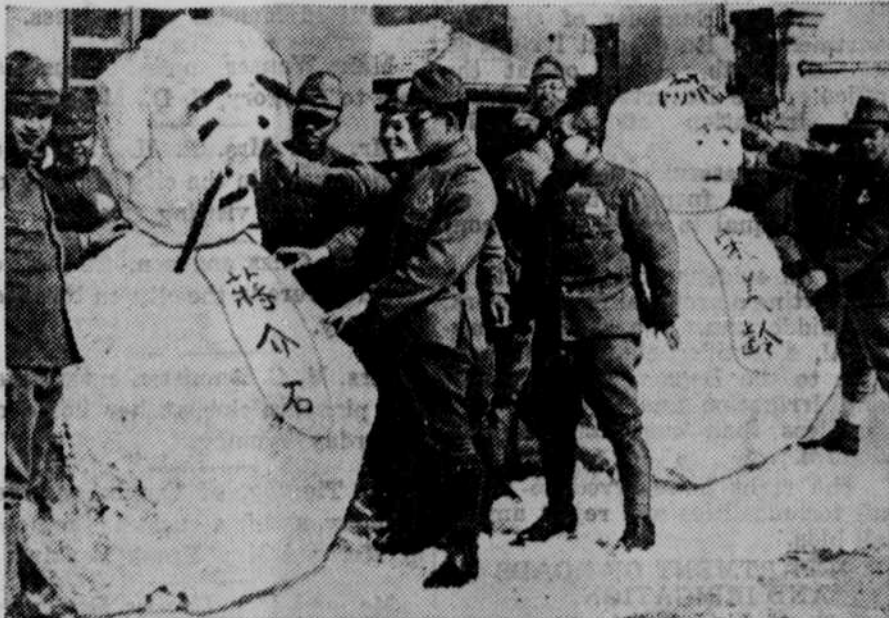
Japanese soldiers of the garrison at Hankow, China, build snow effigies which they named "Chiang Kai-shek" and "Sung Mei-ling," China's fighting marshal and his American-educated wife. Says the Japanese caption—"They will be melted away soon by the bright sun of spring" . . . an unspoken hope that Chinese resistance will melt.