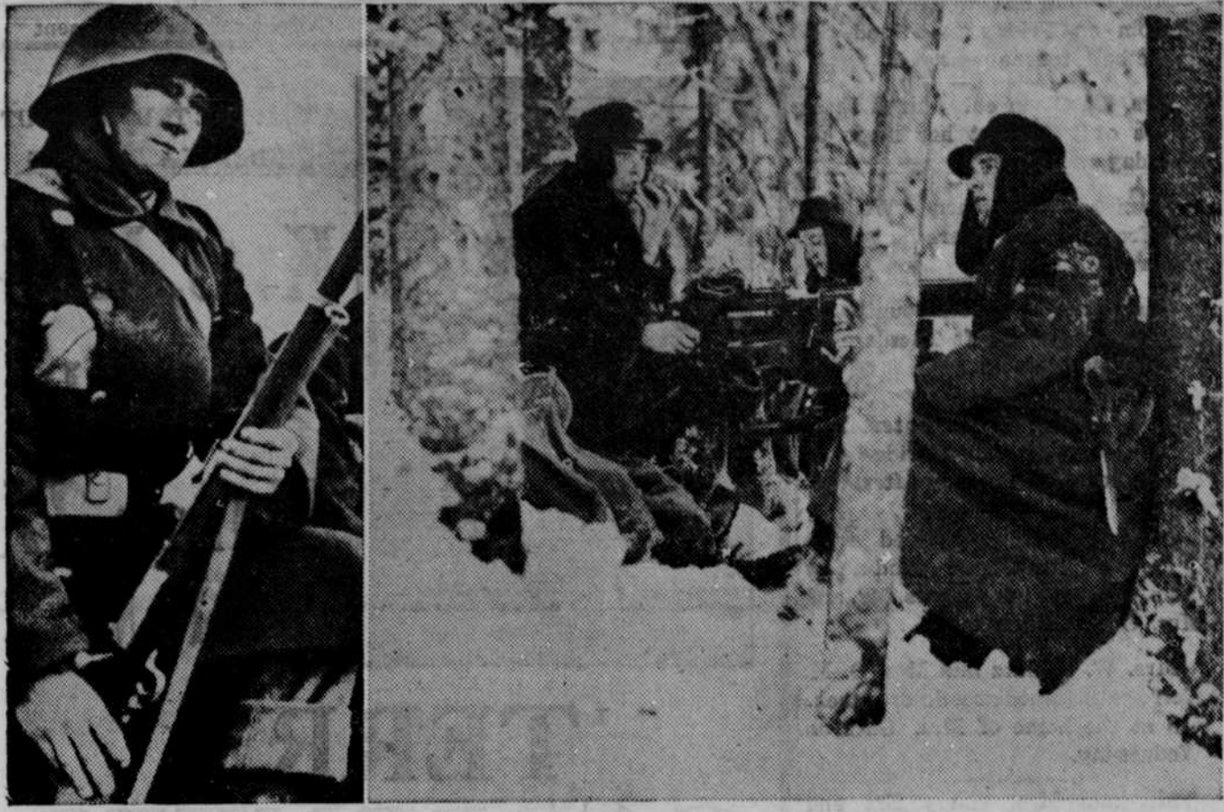
Though Norway, Sweden and Denmark have managed to remain neutral in the current European war, the Scandinavian countries are prepared to defend themselves if necessary. Left: A typical Danish trooper ready to do his bit for freedom. Right: Norse machine gunners pictured during war games on the far northern border of their country. The Norwegian army has adopted many of the winter campaign tactics which proved so valuable to the Finns.