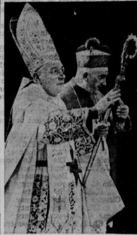
The Most Reverend Samuel Alphonsus Stritch, newly installed archbishop of Chicago, bestows a first blessing upon his followers. Archbishop Stritch succeeds the late George Cardinal Mundelein. Many thousands of people witnessed enthronement services.