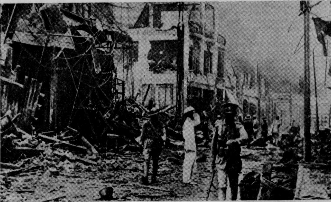
Street scene in Kweilin, Kwangsi province, China, after Japanese planes recently made a raid in which scores of persons were killed and maimed. Chinese soldiers of Marshal Chiang Kai-shek's army are pictured patrolling the bombed area to prevent looting.