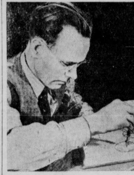
Pictured at work in the office of his Fort Wayne, Ind., laboratory is Philo T. Farnsworth, who was recently designated one of the "ten outstanding young men of 1939." Farnsworth, who is now 34, had filed a patent application on a complete television system before he was 21.