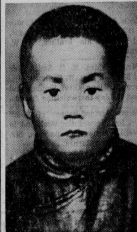
New spiritual and temporal ruler of Tibet, the world's only theocracy, is a six-year-old Chinese peasant boy, Ling-erg La-Mu-Tan-Chu, whose elaborate enthronement recently took place. He is accepted as the reincarnation of the thirteenth Dalai Lama, who died in 1933. Until Ling-erg is 18, a regent will perform administrative duties.