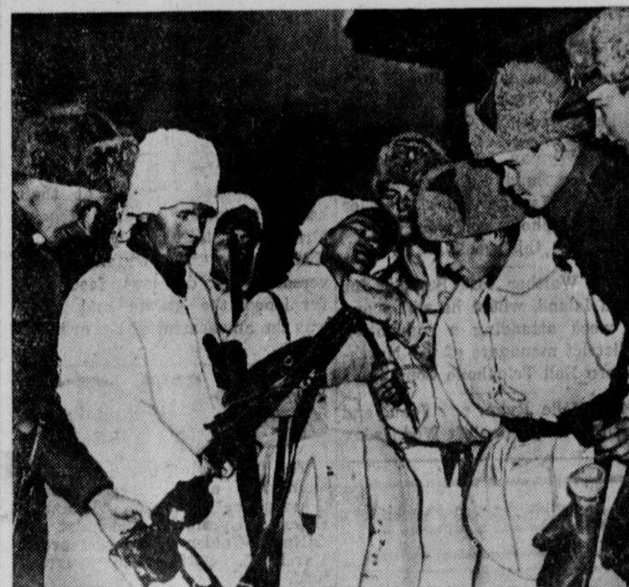
White-clad Finnish soldiers give a "stolen" machine gun a thorough examination before putting it back in commission against its former owners. A foreign military observer estimated that 100,000 Russian soldiers lost their lives in bending the Mannerheim line far enough to threaten the city of Viborg. Finnish newspapers report that Russian material losses so far have amounted to 476 planes, 1,193 tanks, 302 field guns, 399 guns, 630 motor tractors, 117 field kitchens, 1,560 horses and much other miscellaneous equipment.