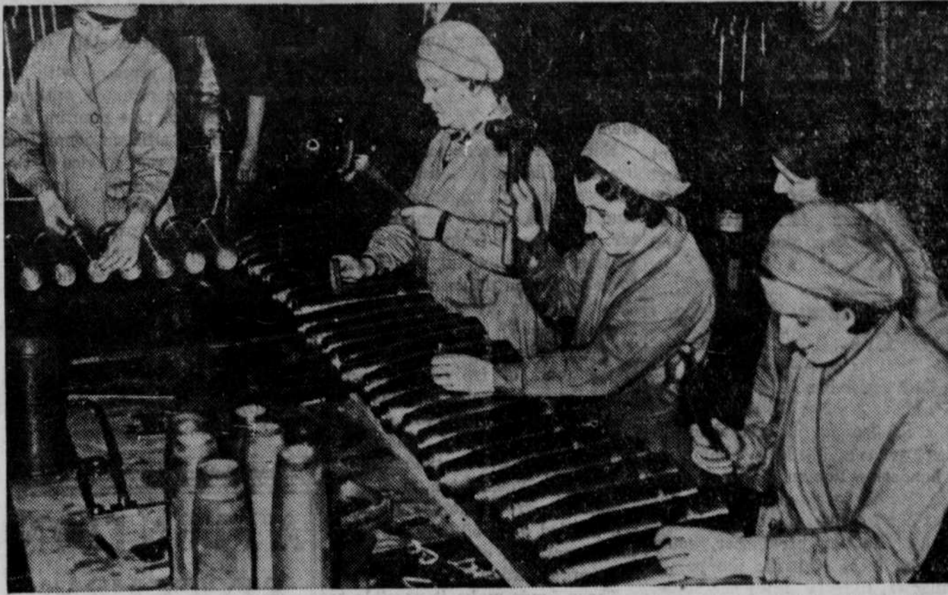
In response to Winston Churchill's call for 1,000,000 British women to aid in the production of munitions, these women workers mark shell cases before the projectiles are filled with explosive. Their workshop is a shell shed in a munitions depot of the British ministry of supply. Some 3,000,000 British women did this work during the World war. An even greater number of French women are taking an active part in war-time activities, many of them working on farms and in industrial plants.