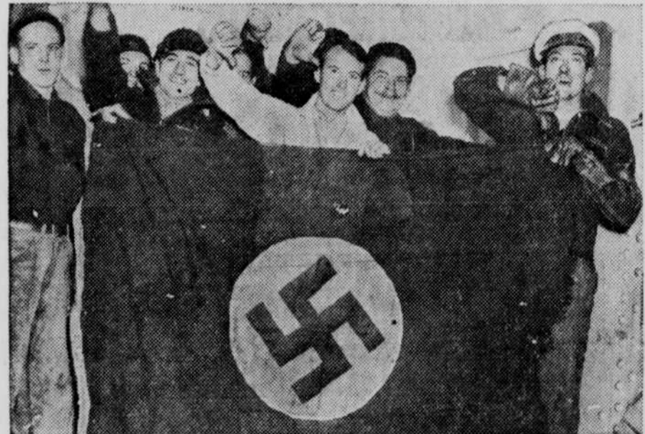
Members of the crew of the City of Flint turn thumbs down on the banner with the pinwheel cross. The City of Flint arrived in Baltimore, Md., recently after an epic cruise which lasted 114 days. This Nazi flag was hoisted by the German prize crew put aboard to take the ship to Germany after its capture by a sea raider. The ship was later freed by Norway.