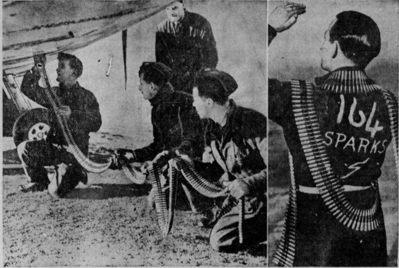
Mechanics load thousands of rounds of machine gun ammunition in the magazines of a Spitfire pursuit plane somewhere in England. The picture was made at a fighter station where the command is responsible for the defense of the country. Right: A radio operator watches the ship take off. Draped around his neck is a "necklace" of bullets intended for enemy airplanes.