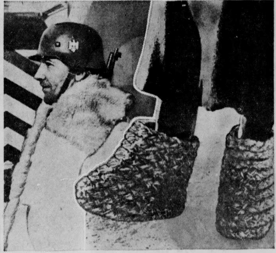
Cold weather and blinding snowstorms in Poland have forced Germany's army of occupation in Poland to employ unusual methods to fight Old Man Winter. Left: A sentry on duty keeps warm with a sheepskin overcoat, which, according to the English censor, was stolen from a "poor Polish shepherd." Right: A German trooper's feet encased in woven straw overshoes in accordance with the Reich's "ersatz" campaign.