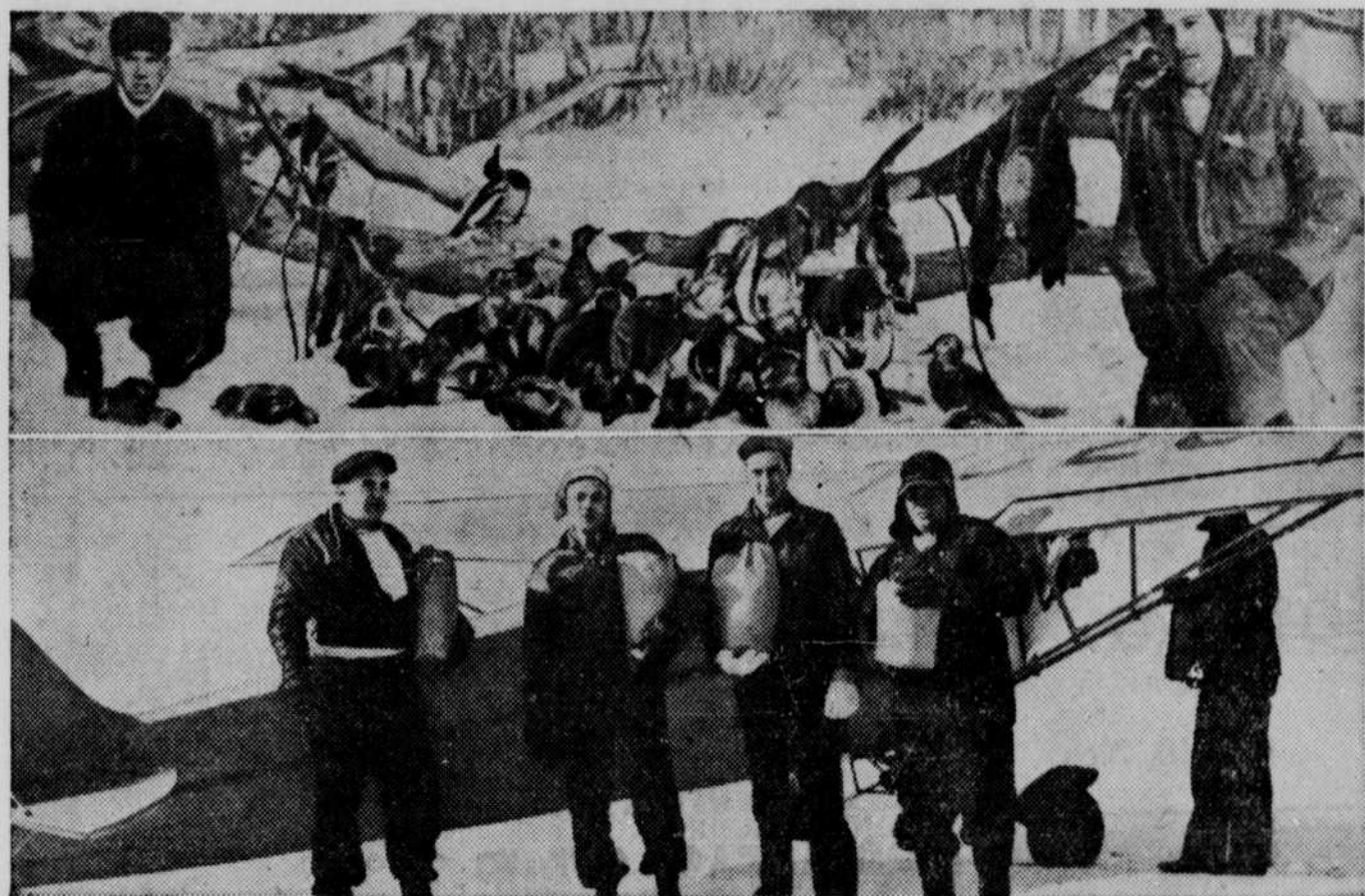
More than 50,000 wild ducks were saved from starvation when Illinois sportsmen distributed six tons of grain from the air along the Illinois river in the LaSalle region. The feed was distributed by the airplanes in ice-locked sloughs and back waters. Top: Some of the hundreds of ducks already dead from starvation. Bottom: Loading shelled corn in the plane at the LaSalle-Peru, Ill., airport.