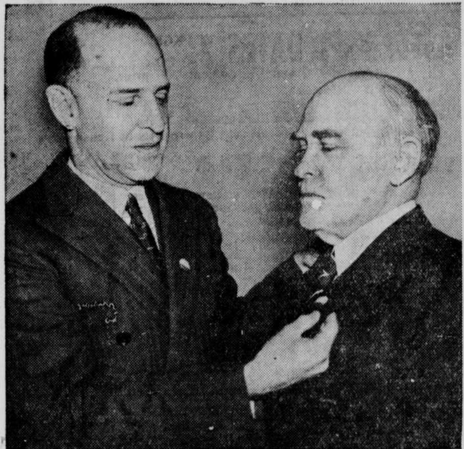
Senator Lister Hill of Alabama pins a "Bankhead for President" button on the lapel of Senator John H. Bankhead, also of the cotton state. They are booming the senator's brother, Rep. William B. Bankhead, speaker of the house, for the Democratic nomination for President in the 1940 campaign. Senator Hill is Bankhead's campaign manager.