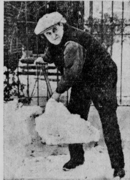
Joe McCarthy, manager of the world champion New York Yankees, lays aside baseball deductions for a snow shovel at his Buffalo, N. Y., home. McCarthy is busy laying plans for the spring training season.