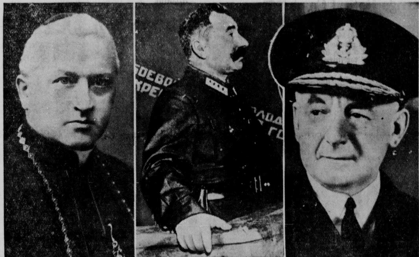
Headliners in recent European news include three men whose activities are of world wide interest. Left: Cardinal Hlond, primate of Poland, who reported to Pope Pius that German authorities are extirpating the Polish people and the Roman Catholic religion in the conquered area of Poland. Center: Marshal Semion Mikhailovitch Budenny, present commander of Soviet troops attacking Finland, who is attempting a more forceful attack than his disgraced predecessor, General Meretski. Right: Sir Dudley Pound, admiral of the British fleet and head of the naval department, who is responsible for England's war at sea.