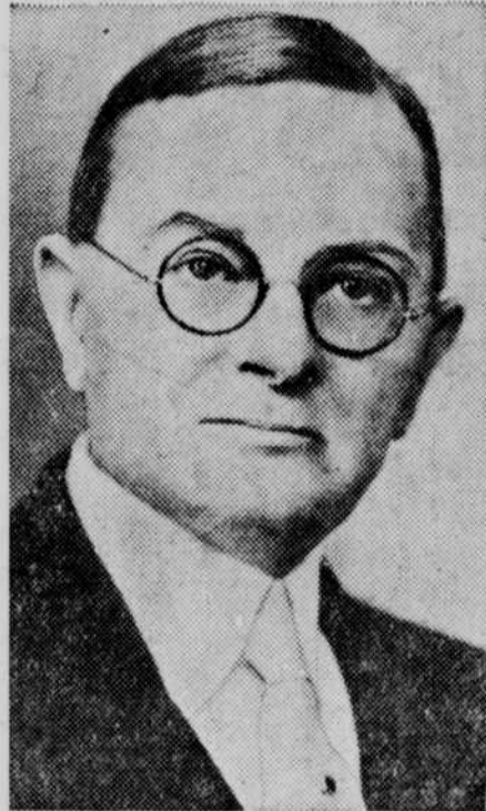
Commander-in-chief of 150,000 census takers is William Lane Austin, whose army will compile essential facts about 132,000,000 Americans, 3,000,000 business firms, 33,000,000 homes and 7,000,000 farms during 1940. Austin, a native of Mississippi, began with the census bureau 40 years ago in a minor capacity and worked to the top.