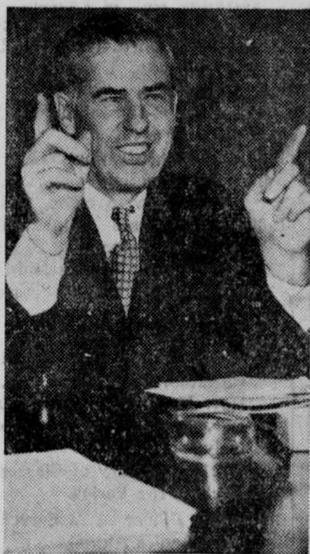
Secretary of Agriculture Henry Wallace as he appeared before the house ways and means committee to testify in defense of extension of the reciprocal trade agreements act. At the hearing Secretary Wallace admitted that he would "like to keep on being secretary of agriculture."