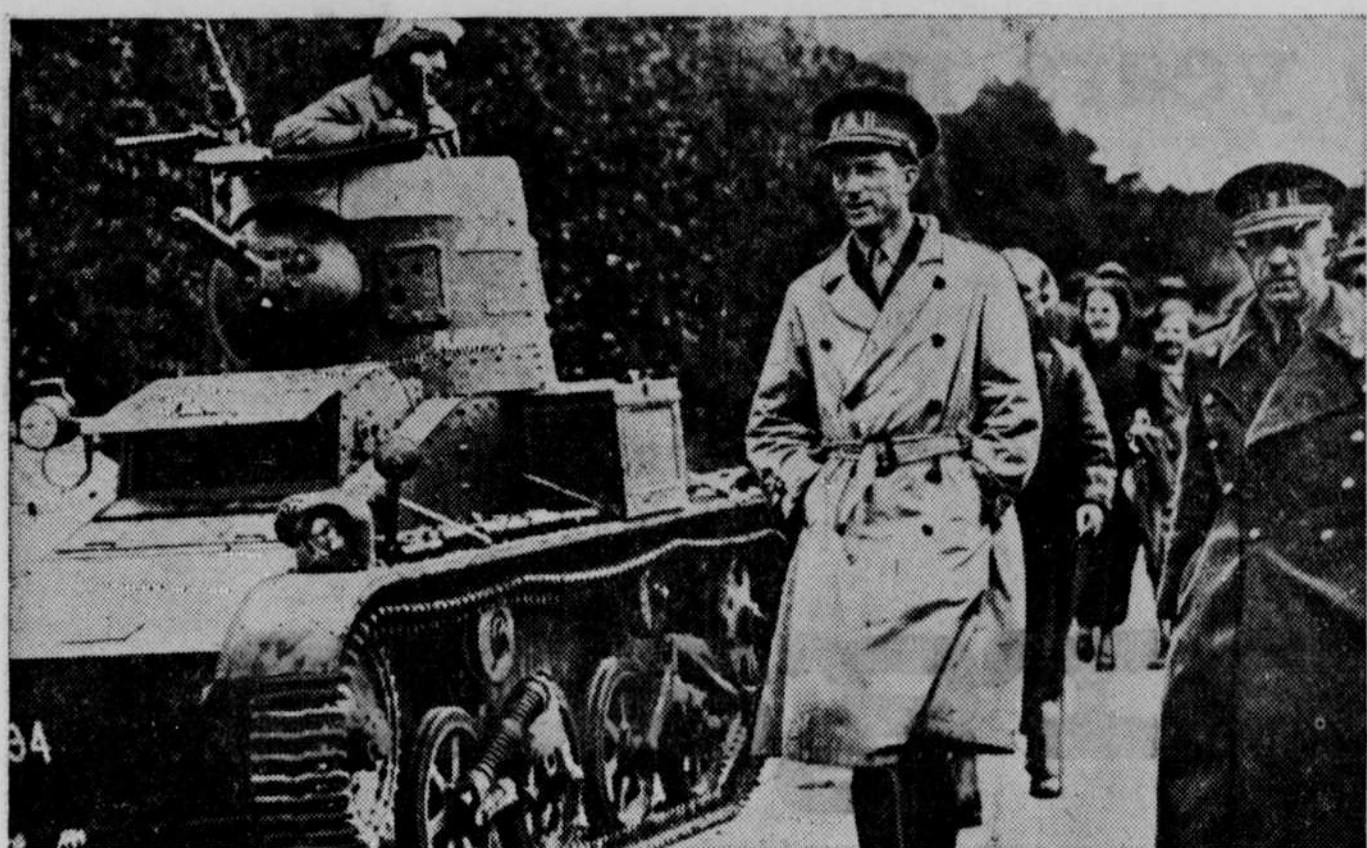
Leopold, soldier king of Belgium, walks past a tank as he inspects Belgian defenses along the border fronting Germany. Similar scenes are being enacted in the Netherlands, another lowland country, where troops also have been massed to fight the threat of Nazi invasion. In case of invasion both Belgium and the Netherlands can be partially flooded by means of dikes.