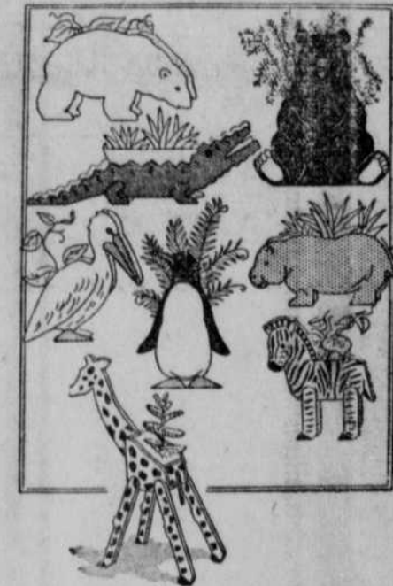
Pattern No. Z9069

HERE is a new department that we know is going to meet with tremendous popularity with our readers, for it brings you the opportunity of combining pleasure and profit. With jig, coping or keyhole saw, you may cut these designs from wallboard, plywood or thin lumber. Each pattern