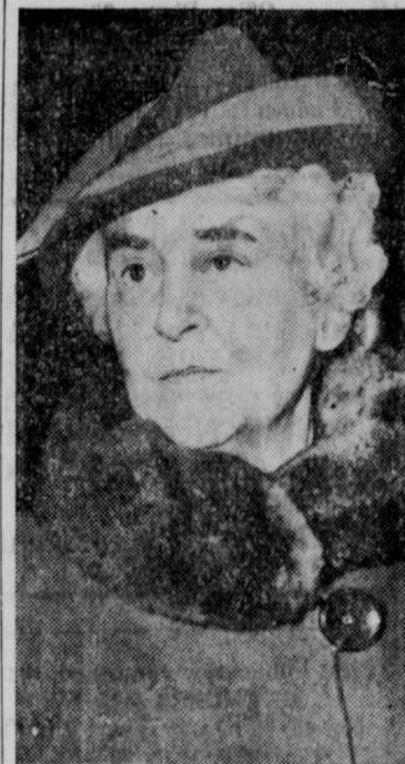
Miss Anne Morgan, sister of financier J. P. Morgan, pictured as she arrived in New York from France. Miss Morgan plans a lecture tour for benefit of the "American Friends of France," an organization to aid French non-combatants who have been evacuated from combat zones.