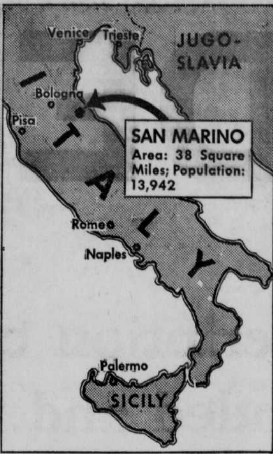
San Marino, oldest and smallest republic in Europe, celebrates the 200th anniversary of its independence in February. Perched on a rock in the heart of Italy, (see map and picture at lower left) San Marino is governed by a great council of 60 members, two of whom exercise executive powers for a term of six months. Free of debt, the country has postage stamps and coinage of its own. It maintains a military force of 39 officers and 900 men (upper left). Abraham Lincoln was an honorary citizen of San Marino.