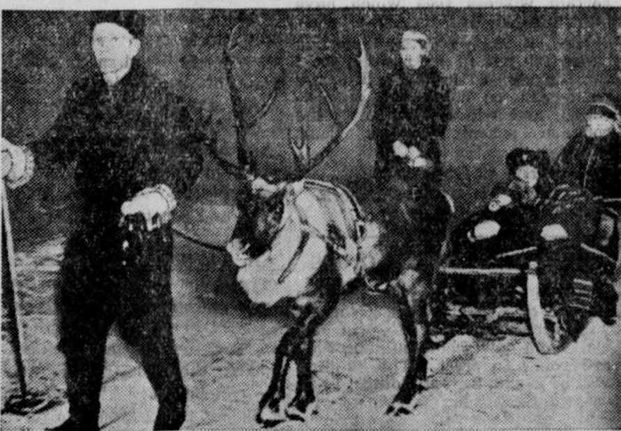
Usually cast in the role of aide to Santa Claus, the reindeer has proved his worth in the Finnish-Soviet war. Here a family of Finnish refugees uses a sled and the family reindeer to transport its belongings to a place of safety during one of the air raids staged by the invaders on Finnish towns and villages.