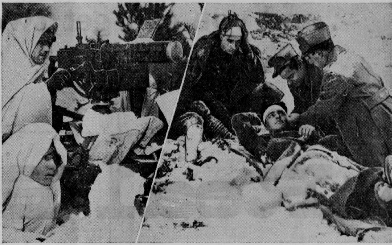
First of American troops to use camouflage measures so successful in Finland were companies of the 101st regiment of the Massachusetts National Guard, practicing winter maneuvers at Camp Curtis Guild, Wakefield. Left: Machine gunners in action clad in the strange white garb, testing its effectiveness. Right: Three wounded guardsmen are cared for by the field medical detachment.