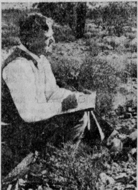
A familiar figure on the desert near Phoenix, Ariz., is Bob Zupke, veteran University of Illinois football coach, who spends much of his time reproducing desert scenes on canvas.