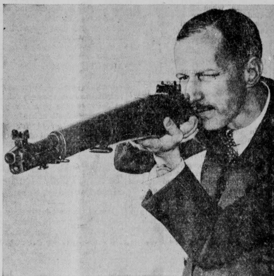
In order to test the effectiveness of the U. S. army's sensational new Garand rifle, Rep. John D. Dingell of Michigan introduced a bill which provided for the sale of 10,000 of the rifles to Finland—at a cost of one dollar each. The Garands cost approximately $1,000 apiece to manufacture. Representative Dingell is pictured in Washington—drawing a bead with a Garand rifle. The bill also provided for the sale of ammunition to Finland—at cost.