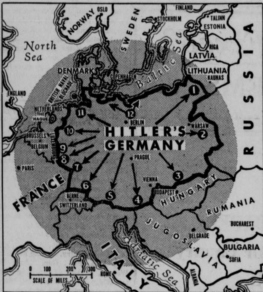
Fear of encirclement by foes self-avowedly led Adolf Hitler to his policy of aggression. Now he himself has completed an iron ring around the Reich. Figures 1, 2 and 3 show the new sphere of Soviet influence; (4) Jugoslavia friendly to allies and close to Italy; (5) Italy has chilled toward Berlin; (6) Switzerland is ready to fight to maintain neutrality; (7, 8, 9 and 10) the western front, with Belgium and the Netherlands rigidly neutral; (11) North sea blockade by Britain; (12) Scandinavian countries neutral but friendly to allies.