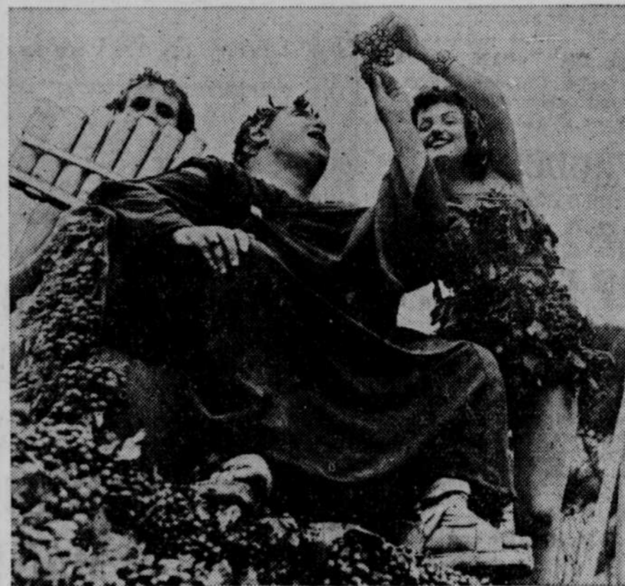
European war failed to dampen the ardor of the 50,000 Italians who celebrated this year's bumper grape crop in Rome, the eternal city. This gay tableau on one of the floats depicts Bacchus undergoing temptation.