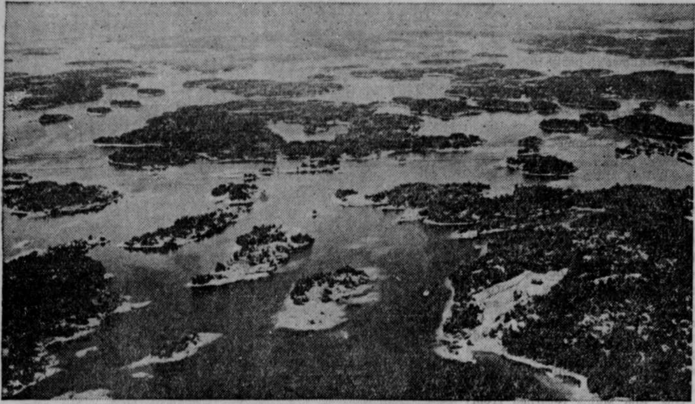
Thousands of tiny islands, some of them no more than reefs, make up the Baltic archipelago that shows on the map as the Finnish-controlled Aaland islands. Though Russia has not formally voiced demands that it be allowed to establish a naval base on the islands, it is expected the request, when it comes, will be rejected flatly by Finland. Rulers of the other three Nordic powers, Sweden, Denmark and Norway, met in Sweden recently to study mutual war problems.