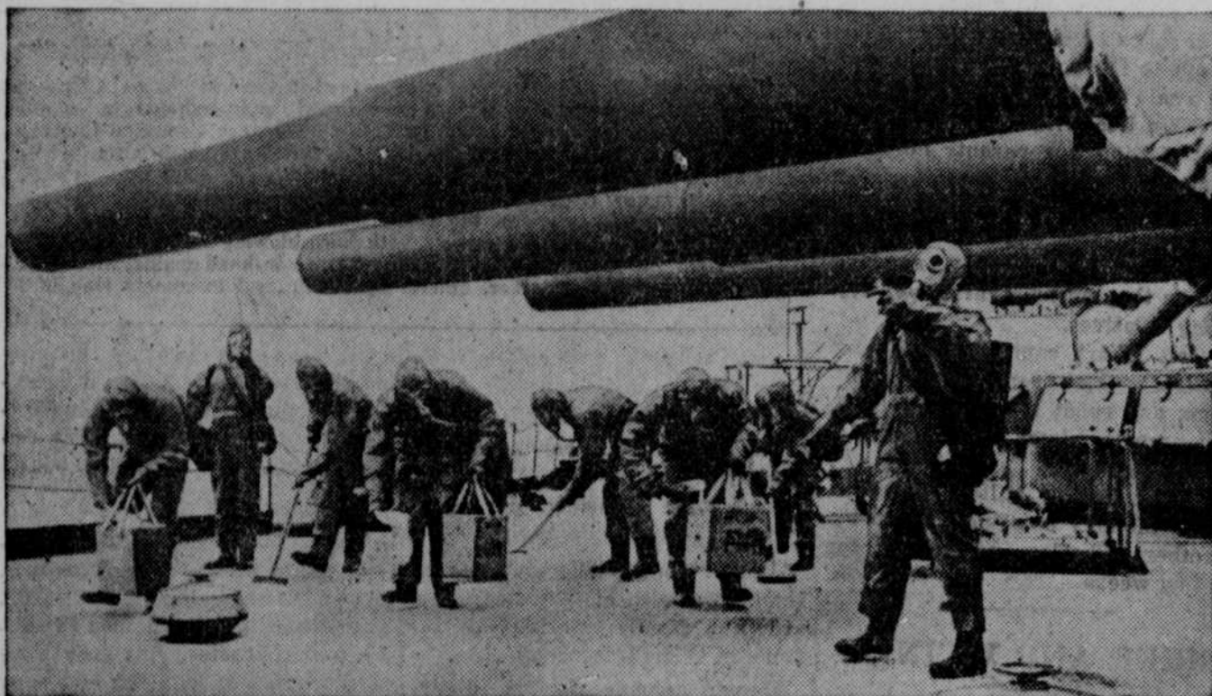
Soviet Russia is busy whipping its fleet into the best possible shape, preparing for any eventuality. Here hooded Russian sailors are pictured spreading anti-gas chemicals on the ship's deck as they decontaminate the vessel. Wearing gas-resistant uniforms, the men spread powdered neutralizers on the deck while others spray objects overhead with liquid neutralizers.