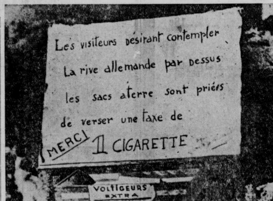
Visitors to France's front line meet a new and delightfully different "instrument of war." They find they can pass into the line upon payment of a tax of one cigarette. Payment gives the right to view German lines by looking over the sand bags.