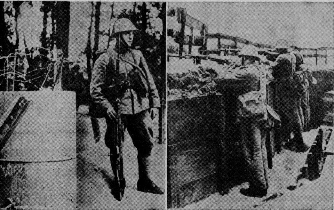
"Somewhere in Holland too close to Germany" is the only locality identification given for this show of Dutch preparedness on the German border. Left: A steel-helmeted sentry stands guard before the entrance to one of the new border fortresses. The concrete stub is a "tank stopper," garnished with steel rails and a bouquet of barbed wire. Right: Soldiers of the Netherlands' regular army stand guard in a trench along the German border. Such scenes are plentiful along the entire frontier.