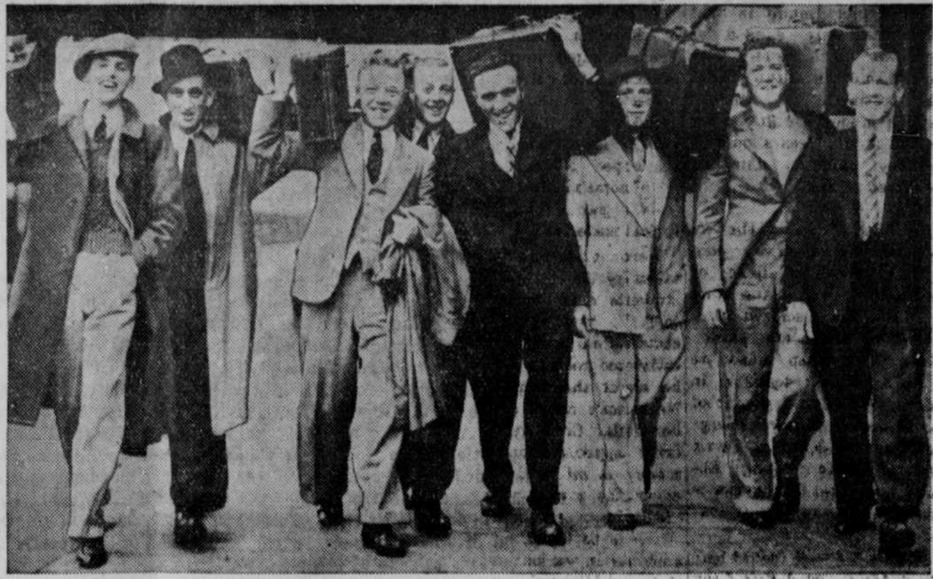
Called to service by an arming Britain, these soldiers—part of 30,000 young men between 18 and 21 years of age—gaily walk into London's Waterloo railroad station, bound for their various camps and barracks. They form the vanguard of 200,000 conscripted militiamen who were babies shortly after the World war ended, and are an integral part of Britain's preparedness campaign.