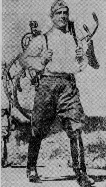
One week each year Fascist leaders must gather to prove their physical worth in leading the people of Italy. Here Achille Starace, 55-year-old Fascist party secretary, carries his bicycle during the route march, one of the less strenuous tests.