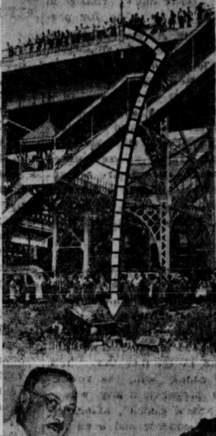
Miraculously escaping death when her cat plunged 150 feet from a viaduct, Mrs. Edna Burdick of New York suffered only a few scratches in the almost unbelievable accident. The broken line indicates the descent of the automobile, which was left a crumpled wreck. Bottom: Mrs. Burdick treated at hospital.