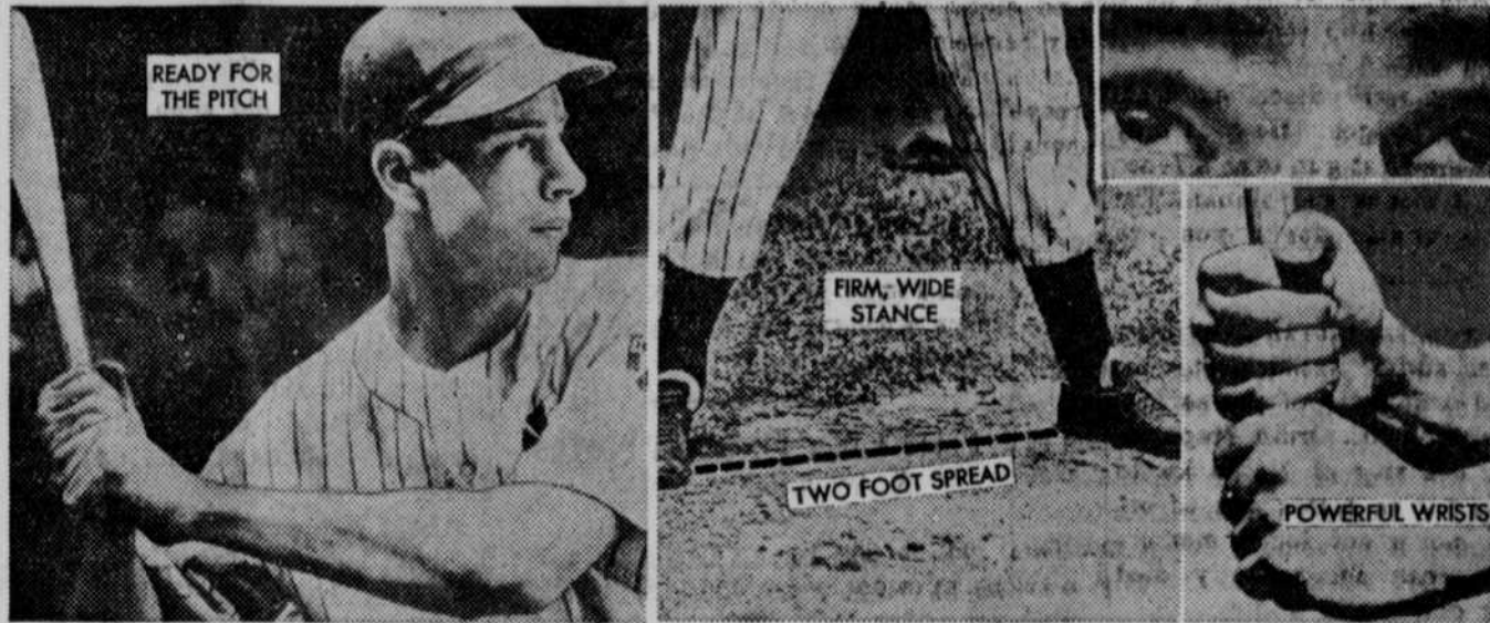
The major leagues are preparing to clear the decks for another .400 hitter—the first since 1930, when Bill Terry hit .401 for the Giants. If he continues at his present clip, Joe DIMAGGIO of the New York Yankees will enter the exclusive company of such stars as Rogers Hornsby, Nap Lajoie, Ty Cobb and others. Here is how he does it: Left: Waiting for the throw. Center: His stance with feet 24 inches apart and just the correct distance from the plate. Pictured at the top right are his keen eyes which follow the ball to the plate. Bottom: His grip on the bat.