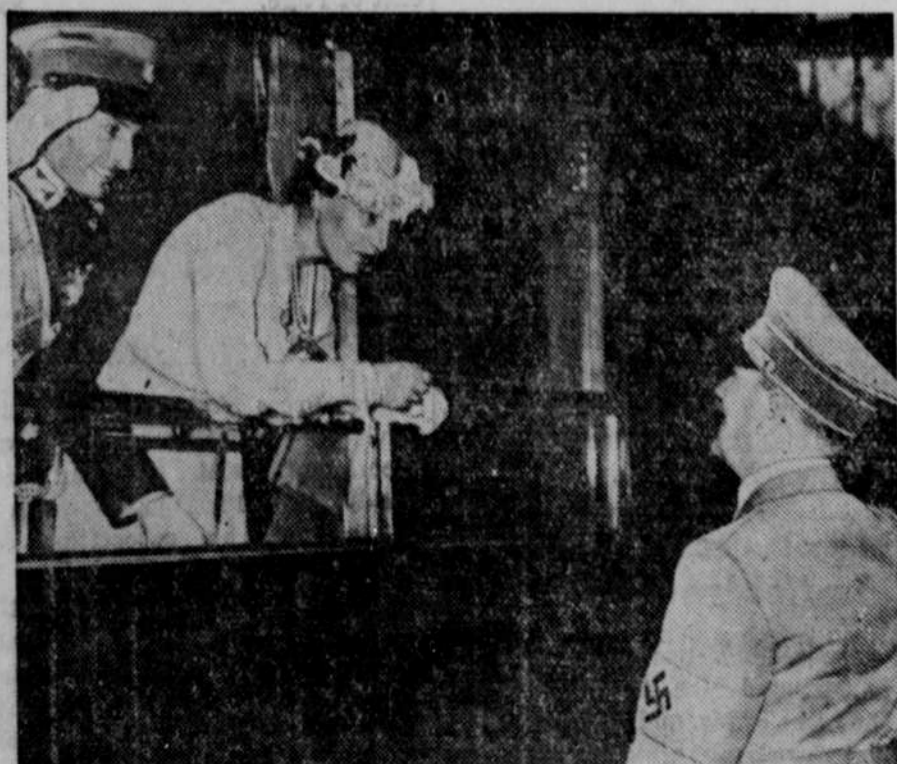
Reichsfuehrer Adolf Hitler plays the gracious host to Prince Paul and Princess Olga of Yugoslavia during their recent trip to Germany, bidding them a temporary farewell as they left Berlin to visit the estate of Field Marshal Hermann Goering. They were the first royal couple at the head of a state to pay a state visit to Greater Germany.