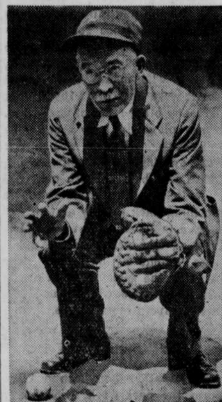
Luren D. Dickinson, 80-year-old governor of Michigan, shows present-day upstarts how baseball was played in his day. He struck this catching pose when he participated in the Old Timers' baseball game in Detroit recently.