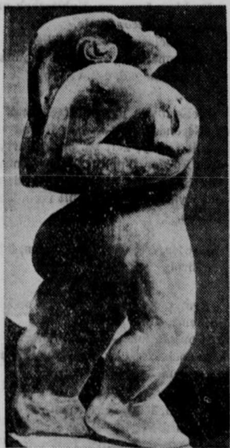
After waiting years for the right moment, the right mood and the right piece of stone, Jacob Epstein, modernist sculptor, created "Adam," which he considers his "greatest work." The huge alabaster figure was completed in 18 months, without benefit of model.