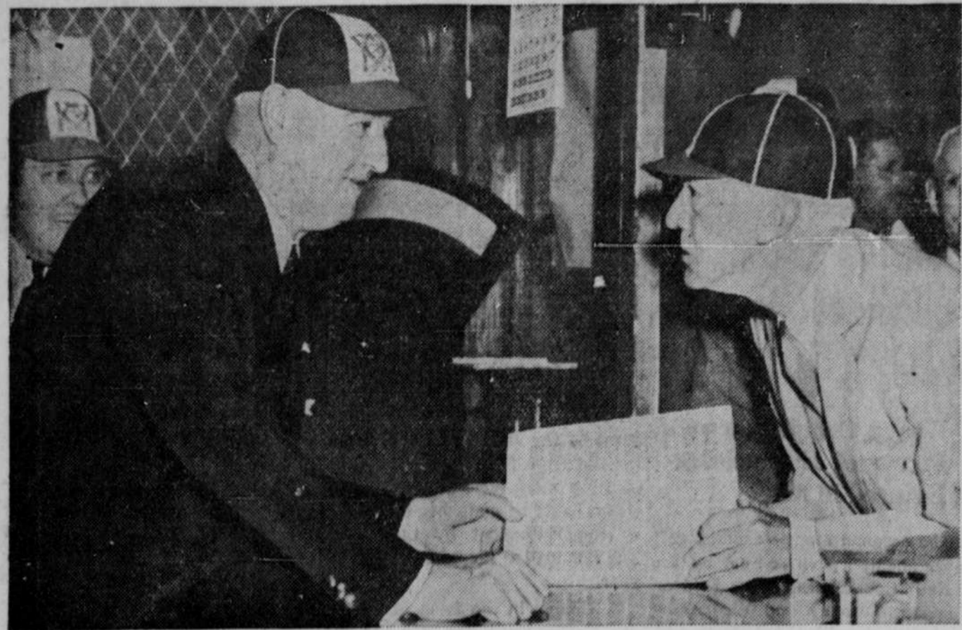
The sale of a stamp series commemorating the founding of baseball got off to a flying start in Cooperstown, N. Y., recently when Postmaster General James A. Farley sold the first stamps to Judge Kenesaw Mountain Landis, baseball commissioner. There Abner Doubleday founded baseball 100 years ago.