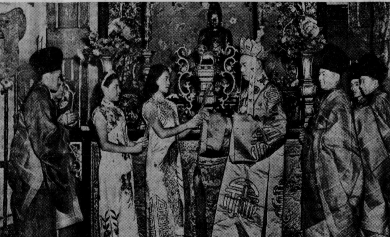
Buddhist rites, devil dancers and the traditional cavorting Chinese lion featured pageantry in Los Angeles' new China city recently when that picturesque quarter was cleaned of ghosts and demons. Replacing the old Chinatown, which was evacuated to make way for a new Union station, China city is the site of many historic incidents of early Los Angeles days. The ceremonies were intended to lay the ghosts of its past.