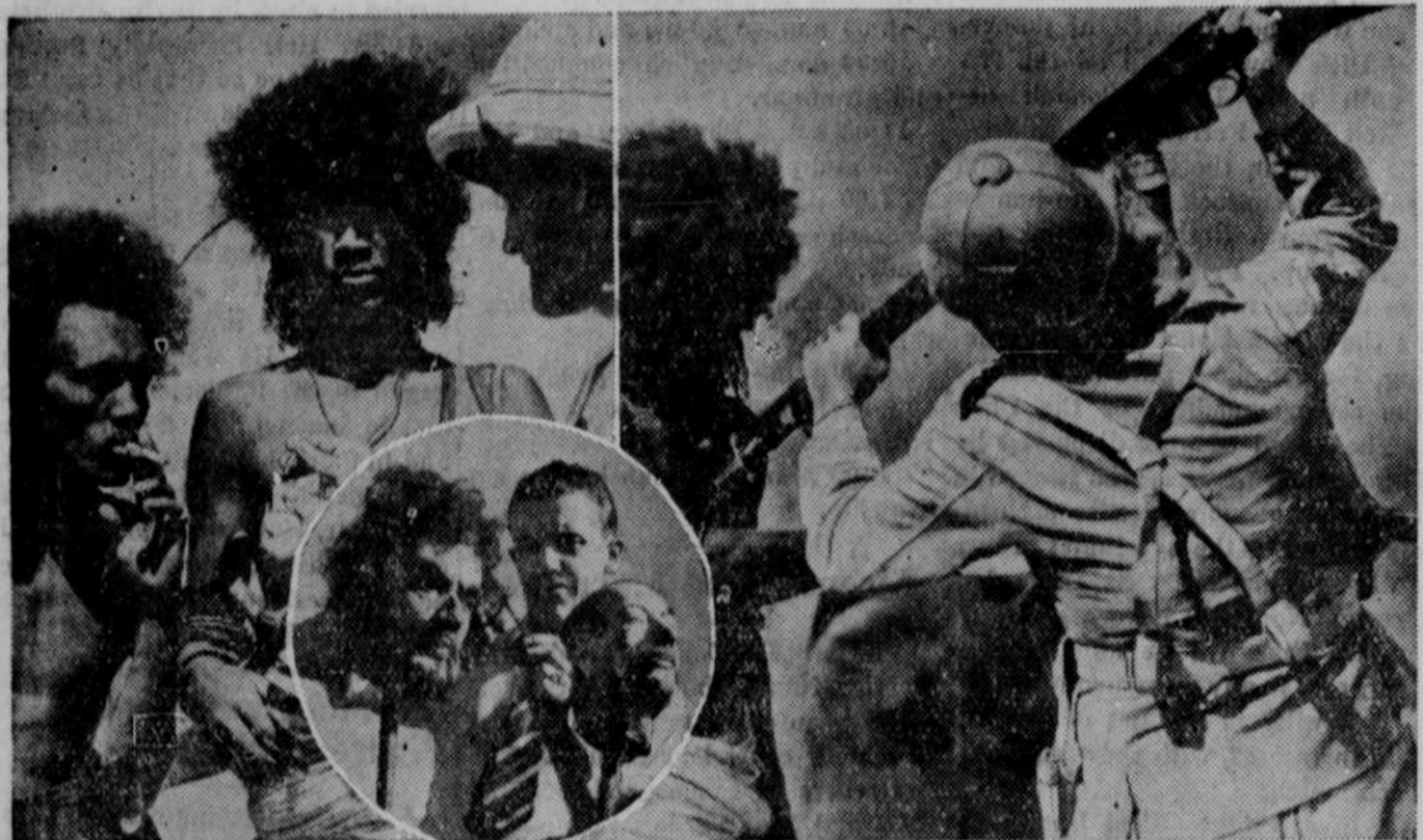
In the welding of the "life line of the British empire," Lord Horatio Kitchener's famous victory at Omdurman, Anglo-Egyptian Sudan, on September 2, 1898, over the fanatic dervish hordes of the Khalifa stands as one of the most important military conquests in England's history. Stemming from this triumph was Great Britain's complete mastery of Egypt. Now a British movie company is remaking history, filming the battle with the aid of the Hadendowah tribe, known as the Fuzzy-Wuzzies, a name given them by Rudyard Kipling. Left: Natives relaxing before a "battle." Circle inset: Makeup men create dummy heads to be strewn on the battlefields. Right: Hand to hand encounters between the natives and the soldiers.