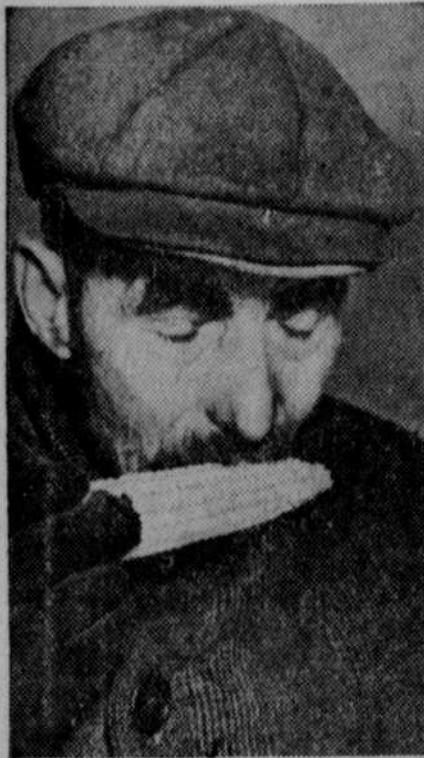
Either the corn was too hot for this old fellow or else he couldn't wait to take off his gloves before digging into the delicious corn-on-the-cob. He is one of the many hungry, homeless vagrants fed by the Volunteers of America soup kitchen in Detroit.