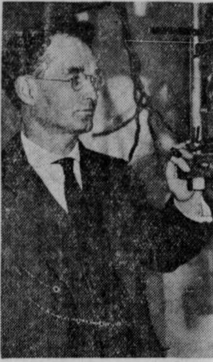
As a protest against what he terms a "misuse" of science by the totalitarian states, Professor Percy Bridgman, Harvard university physicist, has shut his research laboratory to visitors from those countries and refuses to discuss his experiments with them.