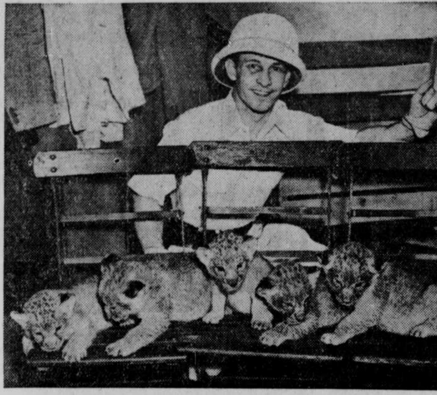
Clyde Beatty, wild animal trainer touring with a circus, has a soft spot in his heart for the baby lion quintuplets which are on the road with him. Birth of five lion cubs is a rarity, according to Beatty, and as sensational in the animal kingdom as the Dionne sisters are to the world.