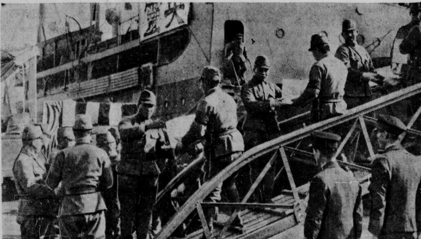
The white boxes being loaded aboard ship in Shanghai, China, contain "Heroes' Souls," the ashes of Japanese soldiers who have been killed in battles in China. Every ship leaving Chinese ports for Japan carries these telltale white boxes. The Japanese admit 51,000 were killed in 1938. Previously they admitted 115,000 before the end of 1937. Foreign military experts estimate Japanese losses, killed and wounded, at from 450,000 to 600,000 since fighting began July 7, 1937.