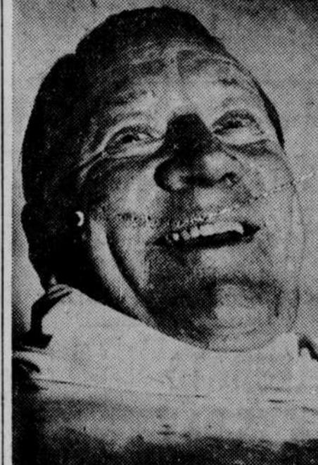
If the senate chamber isn't hot enough for North Carolina's Sen. Robert R. Reynolds, he can always rely on the gymnasium sweat-box. Through exercise routine he keeps his weight down and stays fit for his duties. A Democratic member of the foreign relations and military affairs committees, he has been a leading critic of the administration's co-operation in the sale of planes to France.