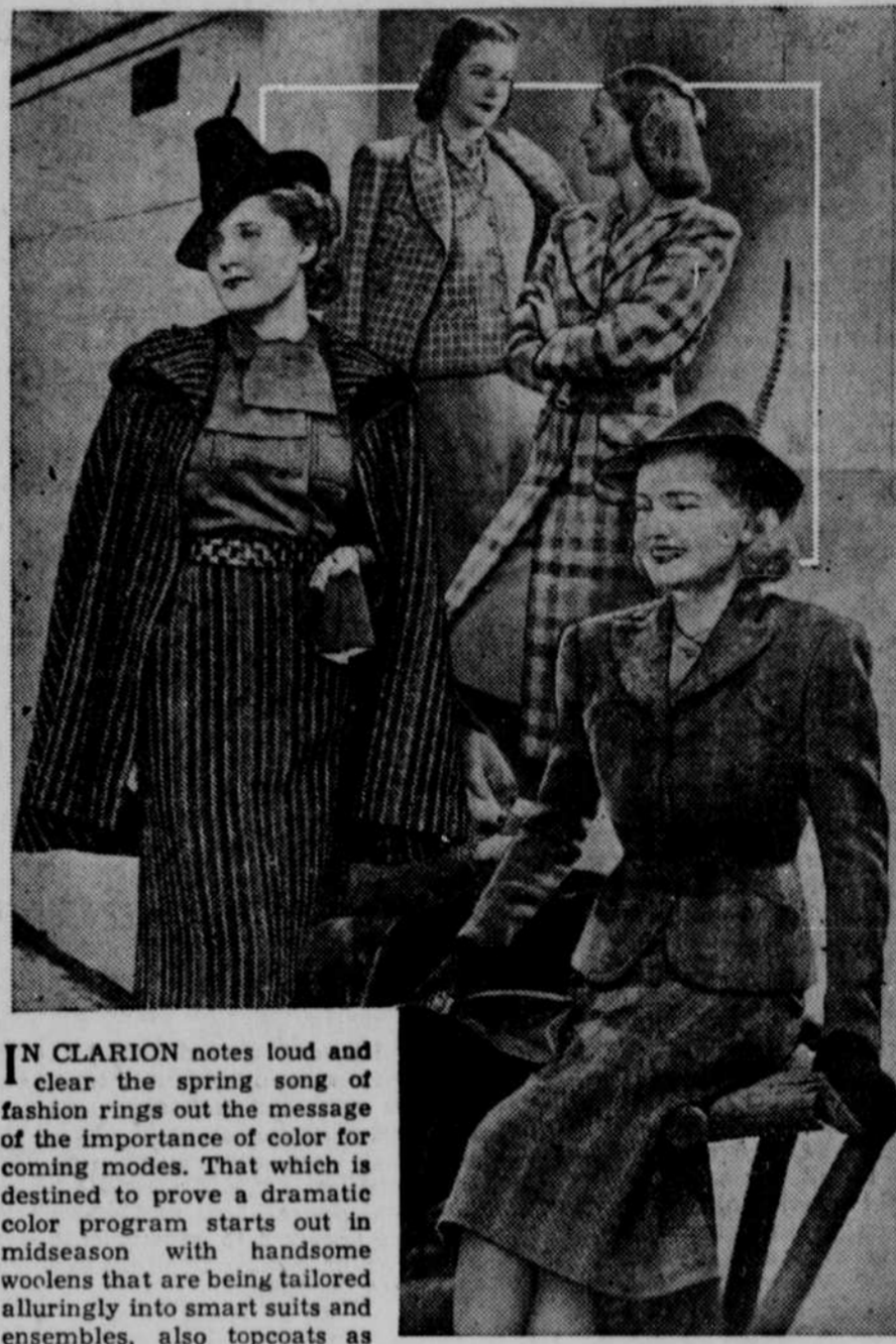
IN CLARION notes loud and clear the spring song of fashion rings out the message of the importance of color for coming modes.

The task that fashion sets before the designer of smart wool outfits for spring is to inter-relate colors, that combined make a harmonious individualized entity of their own.