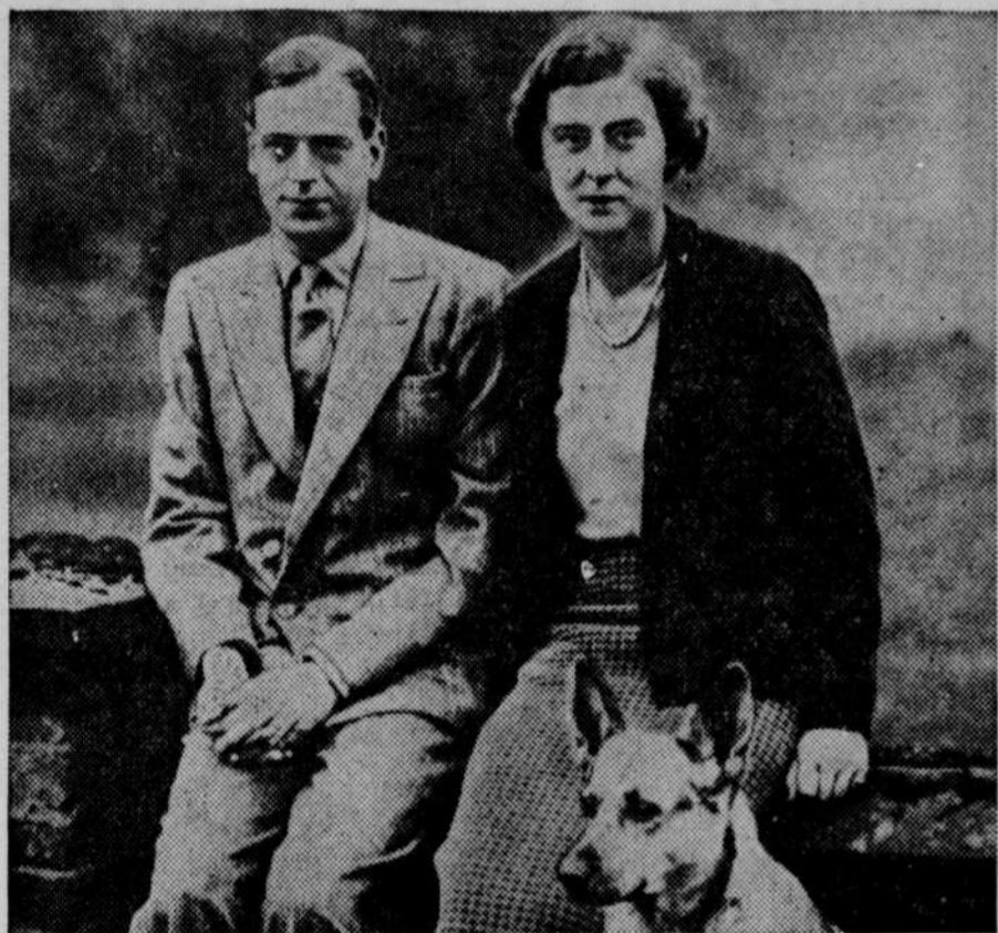
The duke of Kent, and his wife, the former Princess Marina of Greece, who will go to Australia in about a year, where the duke is to succeed Lord Gowrie as governor general. Both the duke and the duchess are very popular, and the appointment of a royal prince to the Australian post is interpreted as a determination of the British government to strengthen the bonds of empire by every means in its power.