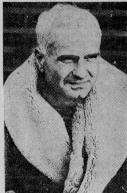
One of the nation's foremost grid-iron strategians, Coach Bernie Bierman, is shown in this candid camera study as he watched his Minnesota Gophers during a workout for their title defense of the coveted Big Ten championship. Coach of the Minnesota eleven since 1932, Bierman's Gopher teams won national honors in 1934-5-6, and the Western conference crown, and a share of it, in 1934, 1935 and 1937.