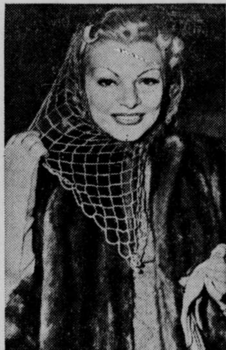
Claire Luce, star of the American stage, arrives from Europe wearing a knitted woolen veil in place of a hat, a la the new European mode.