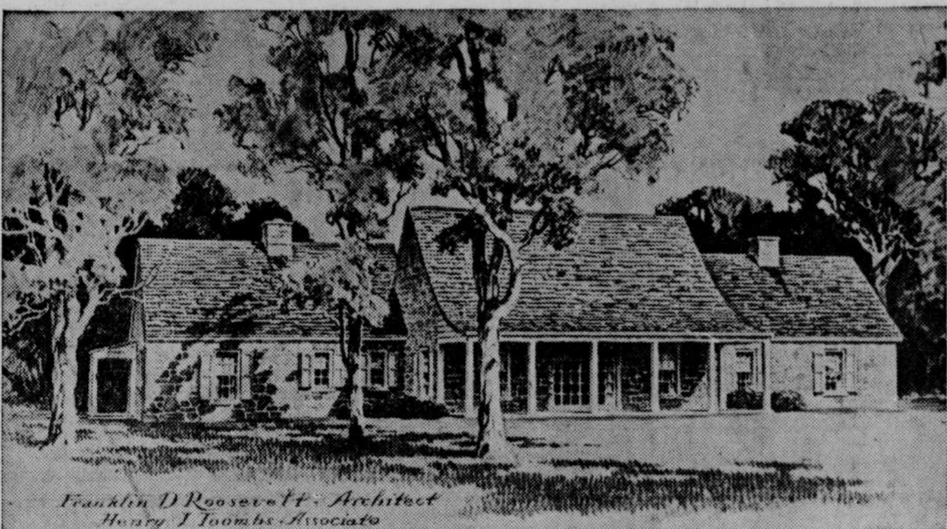
Above is a drawing of the front of President Roosevelt's telephone-less "dream house" at Hyde Park, N. Y., which will soon be ready for occupancy. Designed after the President's own sketch, the $15,000 home is in the traditional Dutch style of architecture, presenting an air of simple but solid comfort. It is situated on a wooded knoll overlooking the Hudson river.