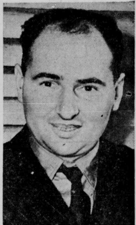
Arriving at New York, John Strachey, leading British writer on communism, was notified that the state department had cancelled the visa he obtained before sailing from England to lecture in this country on socialism and communism. He was not allowed to leave his ship.