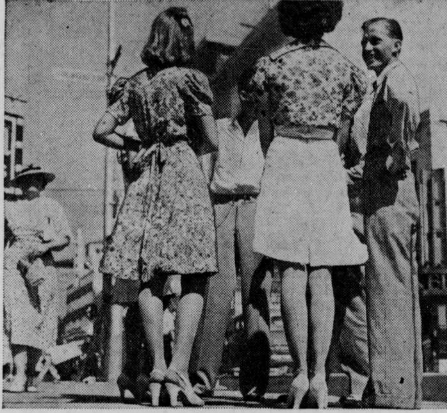
Fashion experts' predictions that the knee-length skirts of the flapper era are on their way back appear a little late. They have already