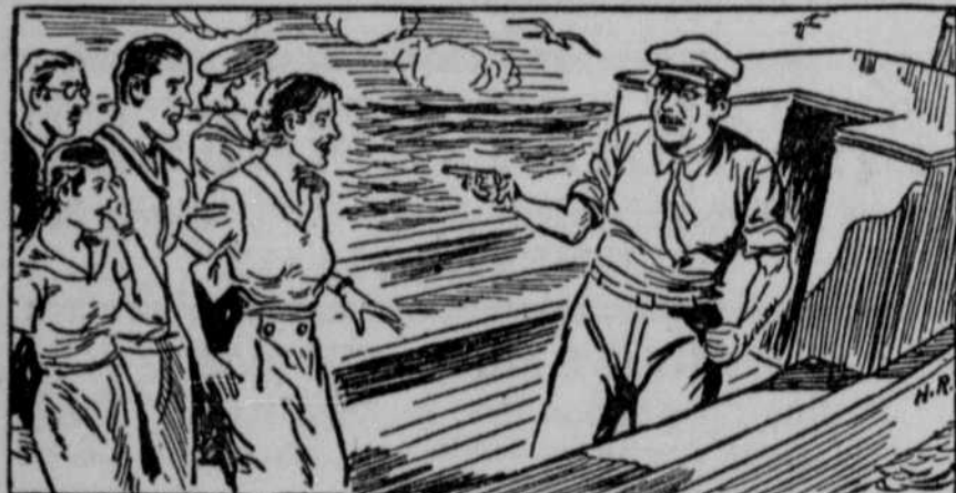
The captain appeared with a gun in his hand.

That didn't look so good. Ninety miles out at sea—out of sight of land—and totally at the mercy of a crazy boat captain. The whole crowd agreed that the best thing to do was to put back to Miami. But the captain didn't agree with them. He flatly refused to move the boat, and said a few things more, too. He told them that not one of them knew