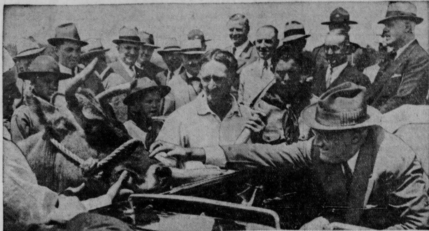
President Roosevelt got close to nature when he visited the little mountain community of Arthurdale, W. Va., site of a federal homestead project. The prize-winning New Deal cow shown in the picture seems unimpressed by the presidential friendliness.