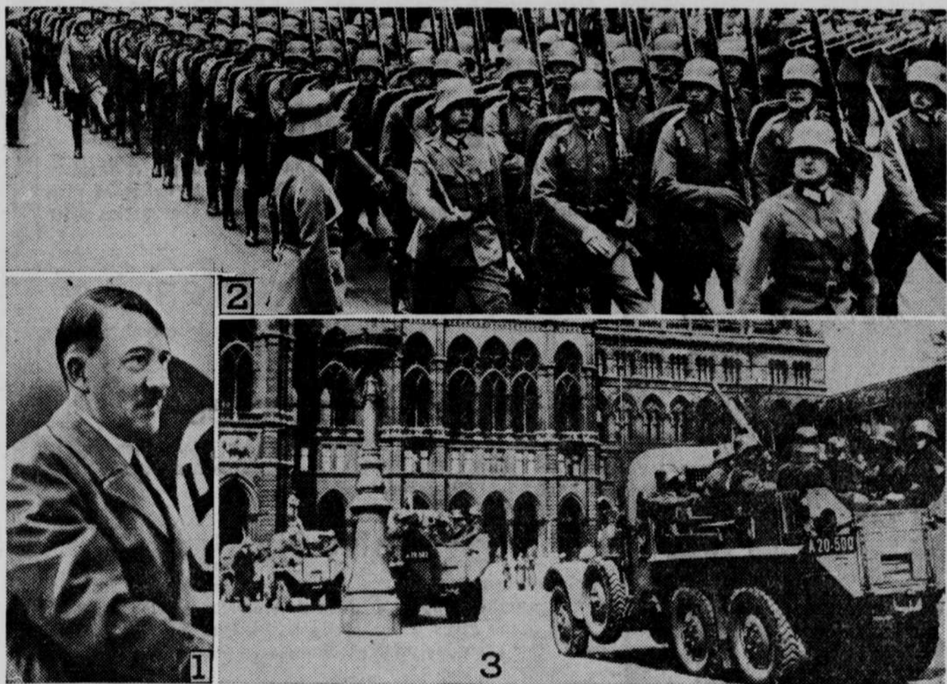
1—Adolf Hitler, who made a triumphant entry into Vienna after Germany took undisputed possession of Austria in a bloodless coup, defying the world to interfere. 2—On to Austria went 100,000 crack German troops like these as Hitler captured his homeland for the reich. 3—Armed German trucks and tanks such as these patrolled the streets of Vienna.