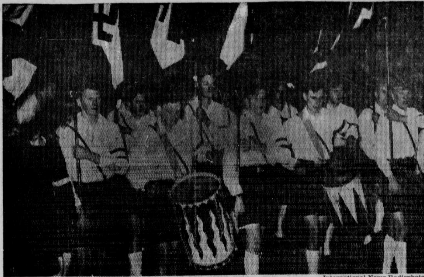
A contingent of the Hitler Youth Organization of Austria are shown parading through the streets of Vienna in celebration of the Nazis' triumphant march into Austria. The successful Nazi coup spelled the end of Austria's existence as a nation and its beginning as a state of the German reich.