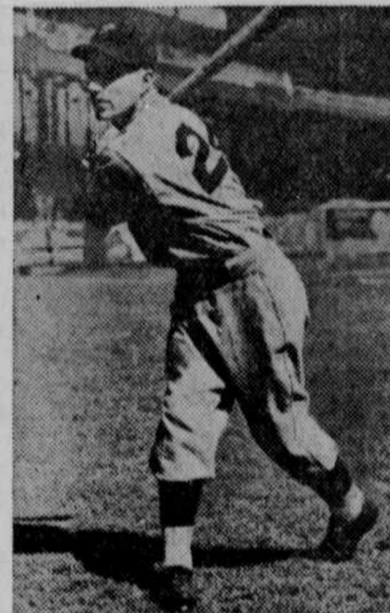
Hopes that the Brooklyn Dodgers may go places in the National league pennant race were raised by the addition of Dolph Camilli, who was purchased recently from the Phillies. Last year Camilli had his best season since breaking into organized baseball. Playing in 131 games, he batted .339, finishing third in the home run standings behind Joe Medwick and Mel Ott with a total of 27.