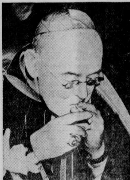
Most Rev. Arthur Cardinal Hinsley, archbishop of Westminster, is pictured in an unconventional pose here. Cardinal Hinsley, one of the five cardinals created by Pope Pius last year, was snapped as he lighted a cigarette, even as you and I, during a luncheon he attended in London.