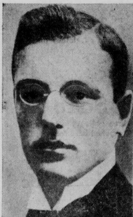
Arthur Seyss-Inquart, made chancellor of Austria by decree of Adolf Hitler, following the resignation of Kurt Schuschnigg and the successful Nazi coup.