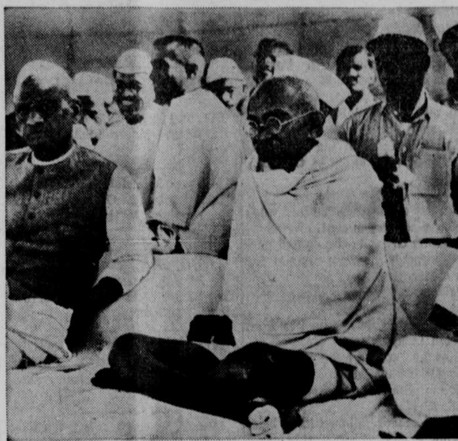
Mohandas K. Gandhi, better known to the western world as the Mahatma, shown taking part in the formal opening of a cattle farm at Haripura, India, in connection with the meeting of the fifty-first Indian national congress. It was the Mahatma's first public appearance in a long time.