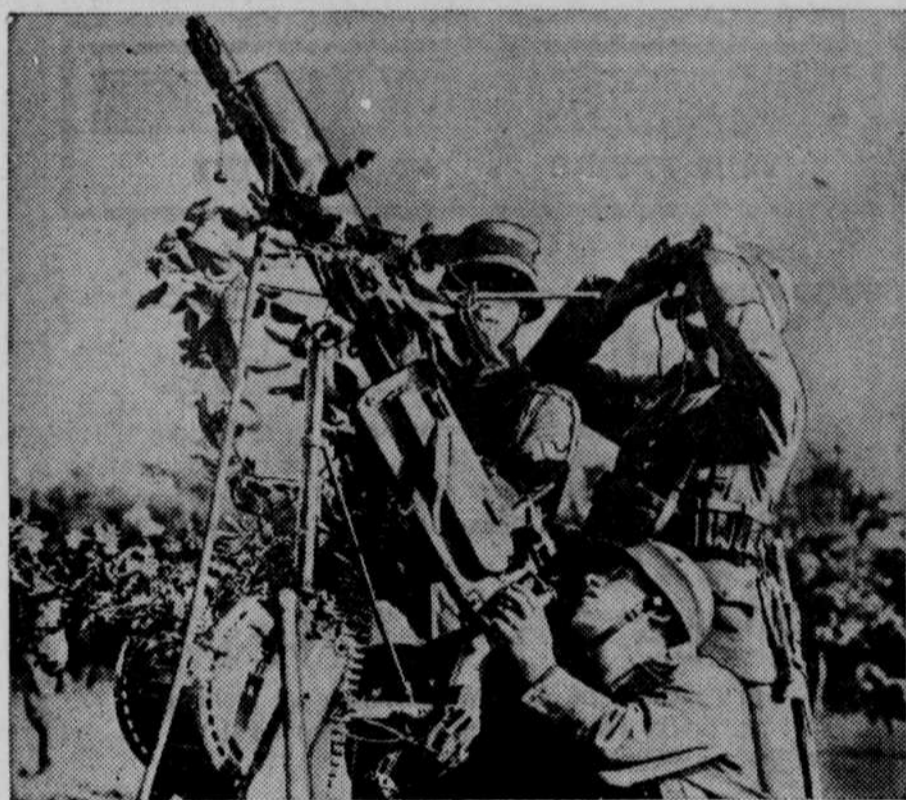
These German anti-aircraft machine gunners and thousands of others like them are enforcing Germany's will on Austria now, since that country became a part of the German reich in Hitler's bloodless coup. When this photograph was made these gunners were merely playing at war in maneuvers at Kissingen, Germany.