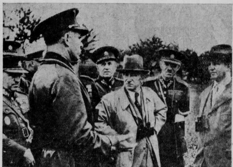
With informed observers predicting that Czechoslovakia will be the next object of Adolf Hitler's Pan-German campaign, following his bloodless subjugation of Austria, the government of Czechoslovakia has reiterated its previous warning that it will resist to the last any attempt to conquer it. President Edouard Benes (center) is shown conferring with some of his military chiefs during army maneuvers recently.