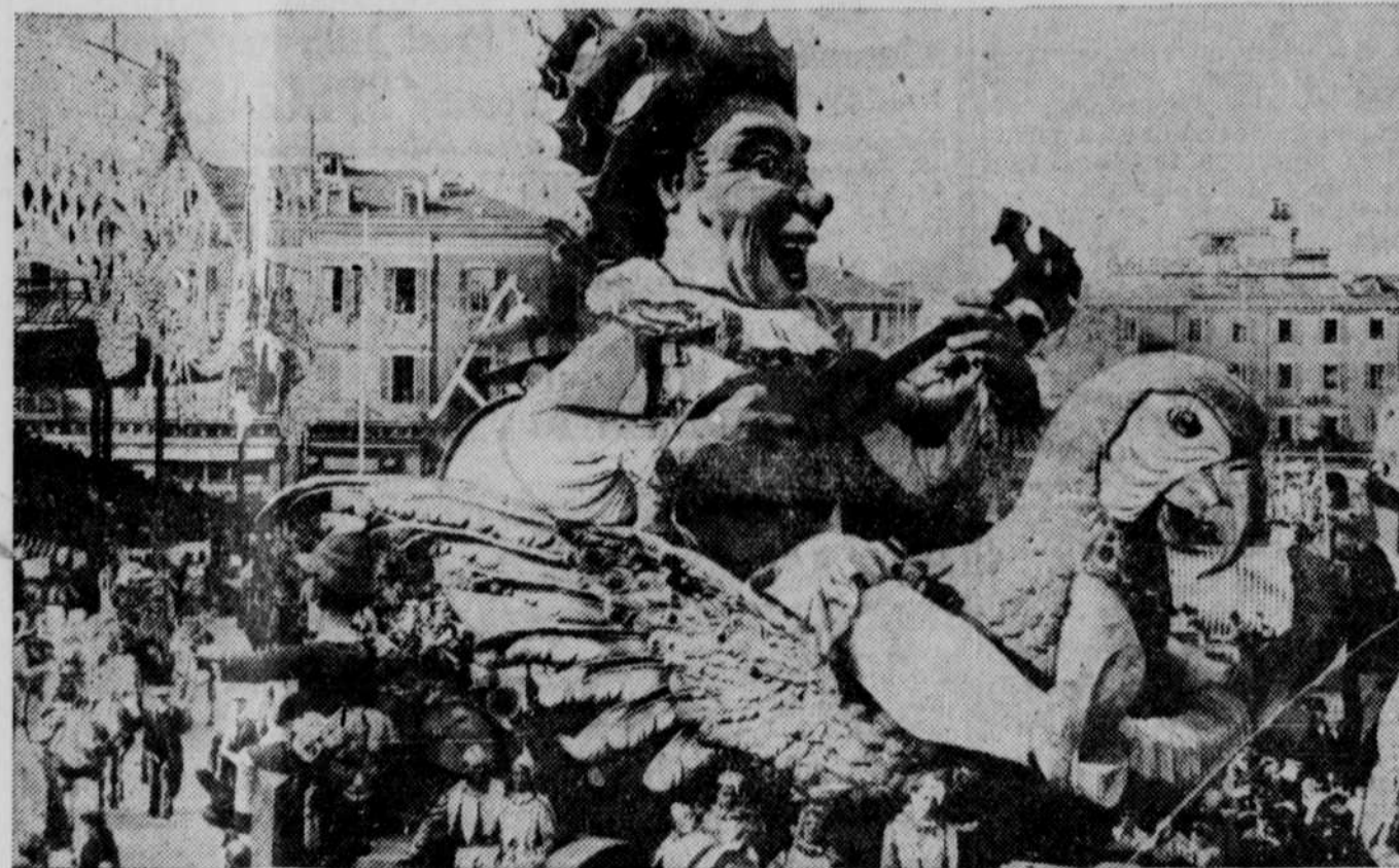
Climax of the brilliant social season at Nice, France, was the annual grand carnival which drew thousands of revelers from all parts of Europe. Here we see the float of His Majesty Carnival LX, which strikes the keynote of the festive occasion.