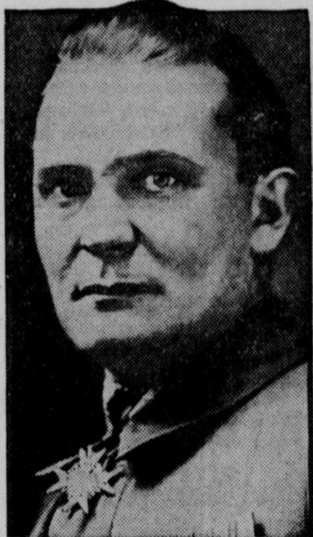
Field Marshal Herman Wilhelm Goering, under whose direction the plans for the Nazification of Austria were successfully completed. Addressing an audience in Berlin following the coup, he declared that Germany is determined further to increase her army.