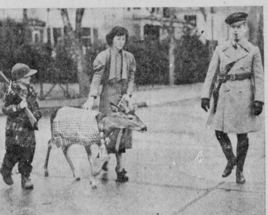
Barnegat Pete, a deer adopted by Barnegat, N. J., after it escaped a forest fire three years ago, is dressed in a red checked coat and red and white catalin necklace so that he will not be shot during the hunting season. The necklace holds a plaque on which is engraved, "This is Barnegat Pete—Barnegat, N. J., children's pet—Don't shoot!" Pete, of course, has the freedom of the village and here a state trooper holds up traffic to give the pet right of way.