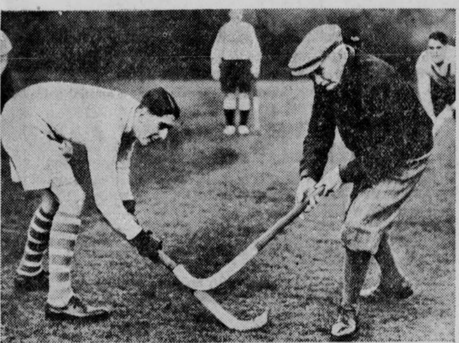
Although he is eighty years old, Rt. Rev. Arthur F. W. Ingram, bishop of London, England, just refuses to feel old. The bishop is shown here (right) as he took part in the annual hockey game for the old Malburnians against Radley college in the grounds of Fulham palace recently.