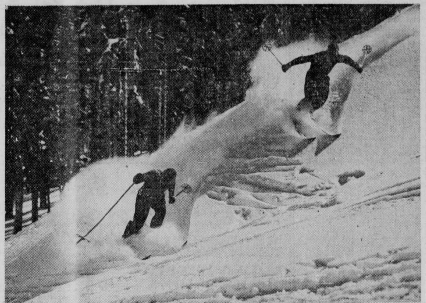
Snow spray sparkles in the sun at Yosemite national park as two skiers execute a double christiana. Yosemite is only one of a number of national parks administered by the Department of the Interior that are famous for their winter sports seasons. Others include Mount Rainier, Rocky Mountain and Sequoia.