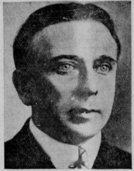
Octavian Goga, new premier of Rumania. A Christian socialist leader, and an avowed anti-Semitic politician, Goga was requested by King Carol to form a ministry following one of the most serious cabinet crises Rumania has ever faced.