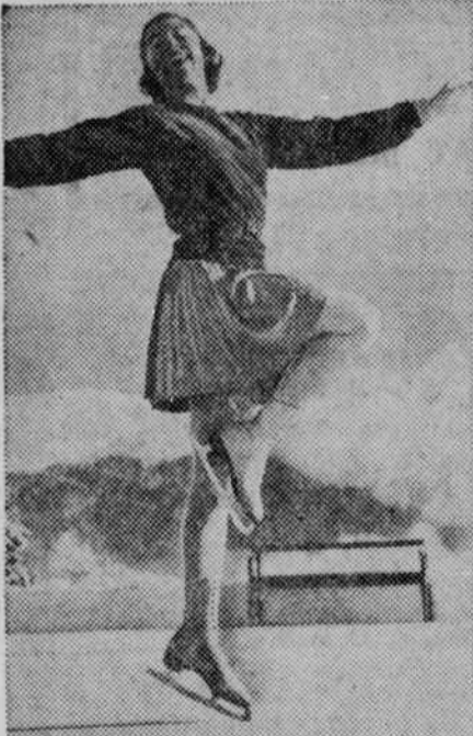
A graceful picture of Miss Cecilia Colledge, brilliant young English skater who holds the world's women's figure-skating title, shown at St. Moritz, Switzerland, as she prepared for an international meet in which champions from many countries participated.