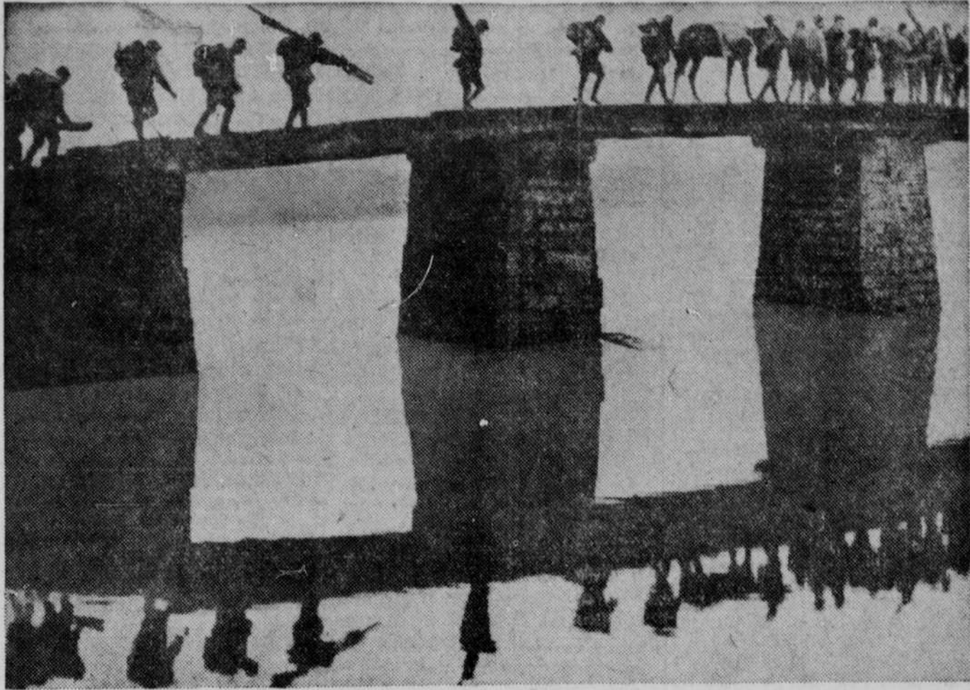
Reflections of the invading Japanese soldiers stand out clearly in the placid water below as they march across a picturesque bridge in North China. Gogs in an inexorable war machine that is rolling juggernaut-like across China, these fighting men might be mistaken in the distance for peaceful workers homeward bound.