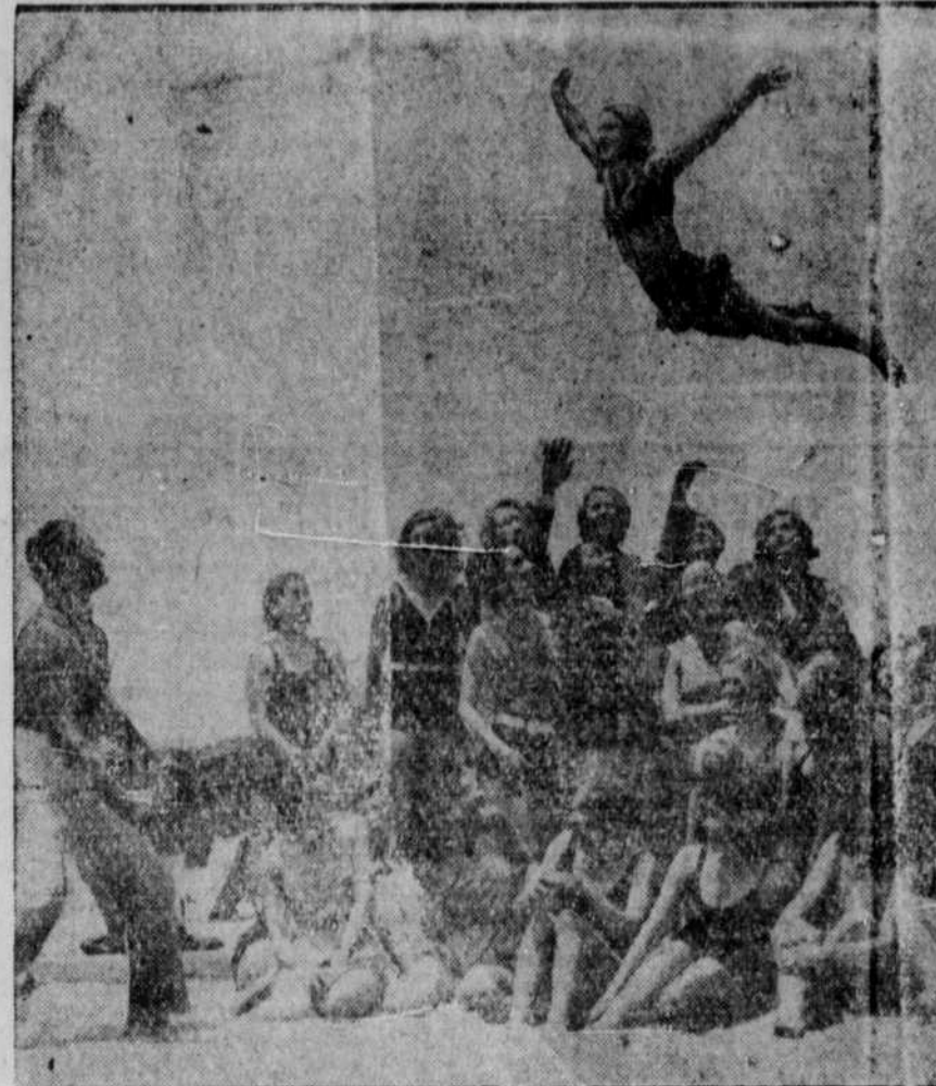
The catch, in this case, is a Miss. But should the Mister miss the Miss—perish the thought! While one girl is being pitched gracefully through the ether, as shown above, others of equal courage are awaiting their turn. This latest for-a excitement is staged on Santa Monica Beach, Calif., where adagio team and chorus beauties keep in trim. Quite trim, we'd say!