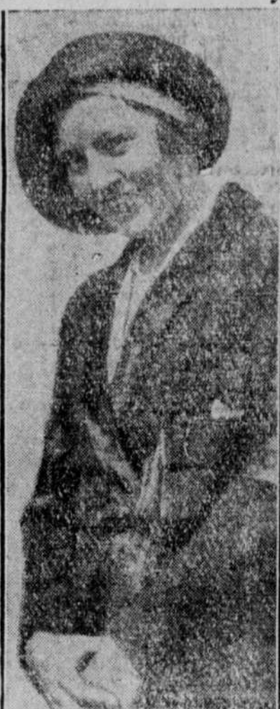
Arriving in Los Angeles from New York, Ruth Elder, noted aviatrix, spiked a report that she would again attempt a trans-Atlantic flight. Miss Elder, who is now Mrs. Walter Camp, declared that she wouldn't fly any more oceans unless her husband goes along with her, "and," she added, "Walter isn't much on flying."