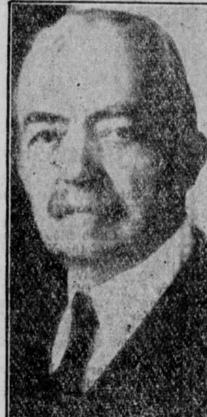
Credited with taking a leading part in developing Niagara Falls power and many other great projects, Edward Dean Adams, one of America's greatest engineers, is shown above in one of his most recent photos. Adams was eighty-five and was active up to his death at his home in New York.