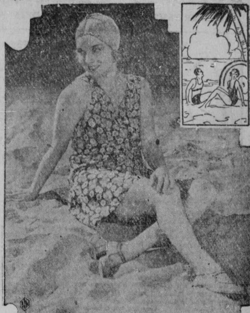
Here's convincing proof of the point that the well-advertised weather is not the only asset in California. One might even be pardoned for saying that the beautiful maiden so alluringly draped by the sea-shore should be what every fully equipped beach needs to ensure lasting popularity. What the wild waves must be whispering to lovely Leila Hyams, M-G-M movie actress, can't be far removed from "Let's get together." You can't blame them, can you?