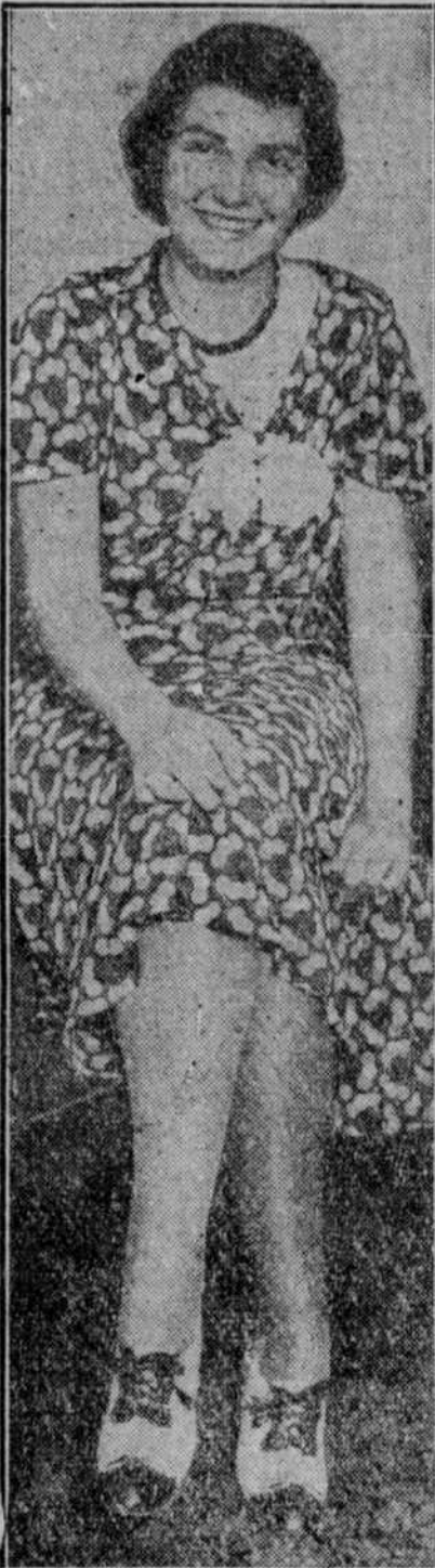
Loretta Turnbull (above), of Monrovia, Cal., is going to stick to Yankee craft, and more particularly her own, when she intends to win boat races. That conclusion was reached on the Riviera recently when on one day, piloting her own speedy craft, she handily won an outboard motorboat race, only to go down to defeat a few days later when she borrowed a Spanish boat. There's quite a difference between first and sixth places.