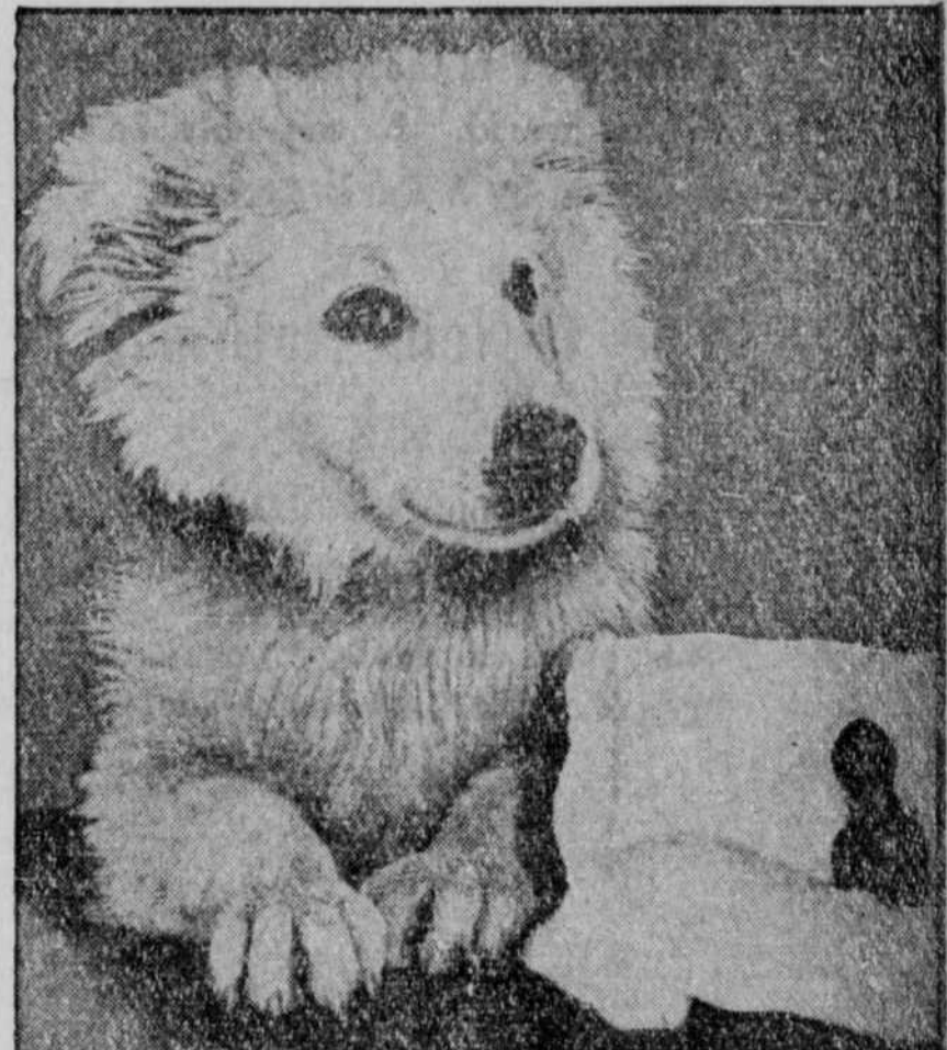
May we introduce to you one winsome pup who answers to the monicker of Sparky? Having just been given such a dose of medical science that the surgeons were literally up to their ears in microbes recovering a baby's rubber nipple which Sparky inopportunely swallowed, the fluffy-haired pup is now ready to take a new lease on life. But he's certain of one thing—he isn't going to steal any more milk from babies. It doesn't pay.