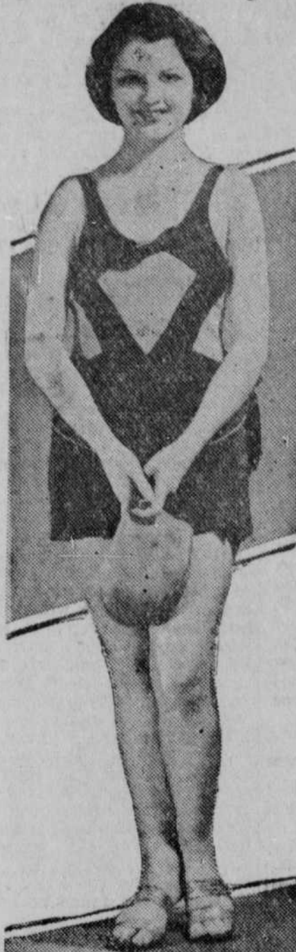
Charmingly displayed by Lillian Bond, screen star, this modernistic patterned bathing suit is carried out in harmonious color combinations. The blending of light and dark green in the above model gives a pleasing effect.