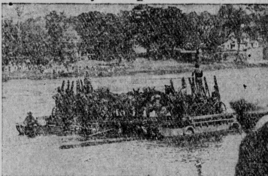
Washington's historic crossing of the Delaware was re-enacted, as shown above, by American soldiers the other day, but instead of the frail boats which the first President and his men had to use, and without the additional hazard of drifting ice, the twentieth century doughboys laid and rolled pontoon bridges to test their strength. This picture shows a pontoon load of men, machine guns, horses and mules crossing the Delaware. If only Washington could have seen it—and marveled.