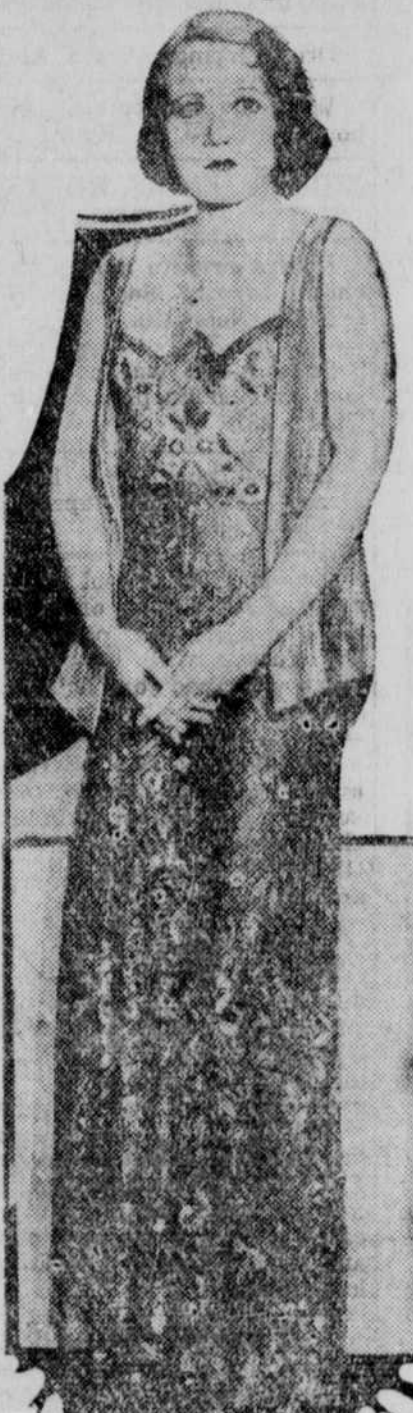
Evening pajamas find their way into the ballroom by Wynne Gibson, who shows her approval of the new mode of divided skirt, ideal for all occasions.