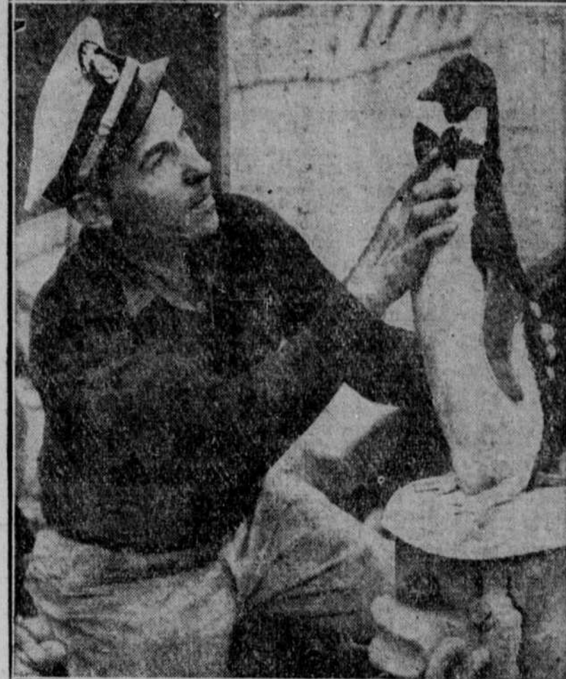
That final touch we all have wished to make to the all but sartorially perfect penguin is added by a member of the crew of Admiral Byrd's South Polar ship City of New York on one of the exhibits as that vessel anchored at Washington, D. C., for exhibition purposes. Nature gave the bird a dress coat and shirt front.