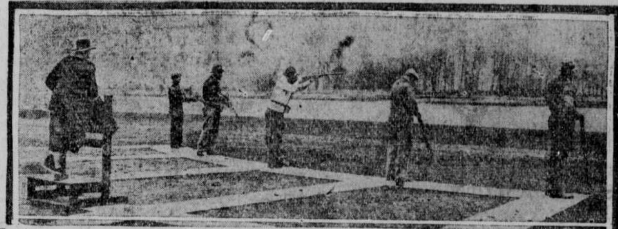
Here's a range scene at Travers Island, N. Y., where marksmen of the Empire State competed for honors in the contest of the New York Athletic Club. Each entrant fires in turn. Note scorekeeper, at left, as he checks up the results while the market for clay pigeons boomed.