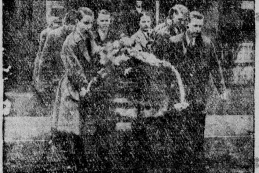
With that infinite tenderness that comes with sincere grief, the body of Knute Rockne is carried from the undertaking parlors, in South Bend, Ind., to his home by members of the 1950 Notre Dame squad.