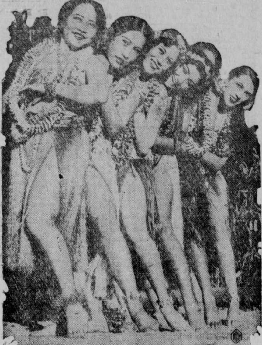
With a background of tropical verdure, which recalled their native land to these former Hawaiian girls, they say "Aloha" to their friends in the first "Luan," or native feast, ever held in Los Angeles, Cal. Dancing and a banquet featuring native dishes made the affair a great success.