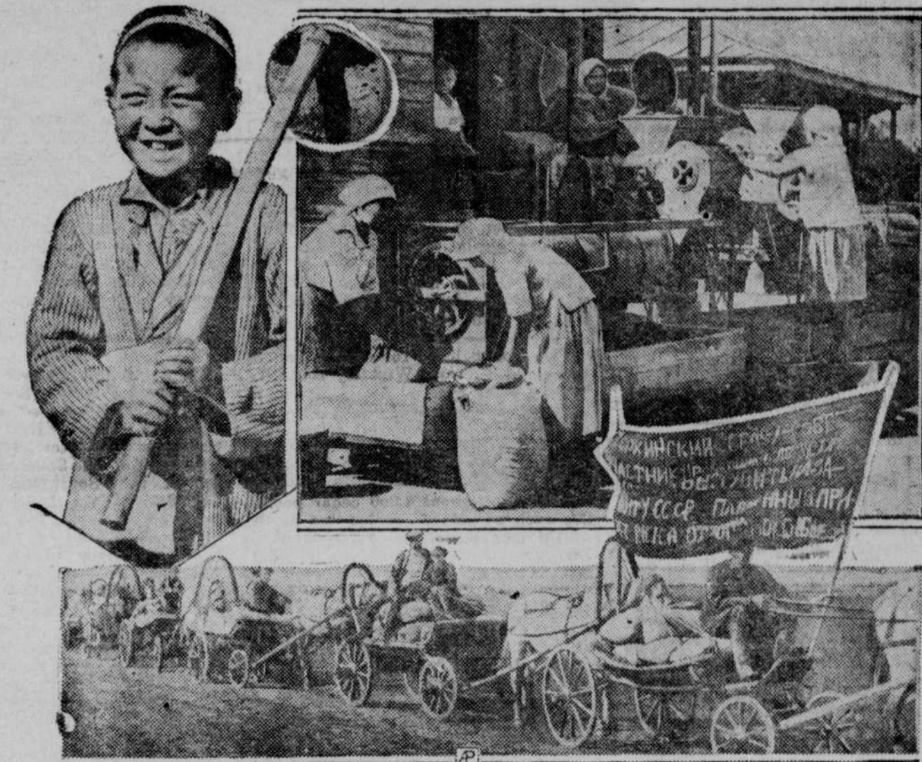
Russia has placed 100,000,000 bushels of wheat on the world market, as one result of its big production program. Peasants in Siberia are shown below hauling wheat to market, and Russian workers (upper right) are shown operating a separator. The boy at left is a young soviet farmer who takes his hoe to school with him.